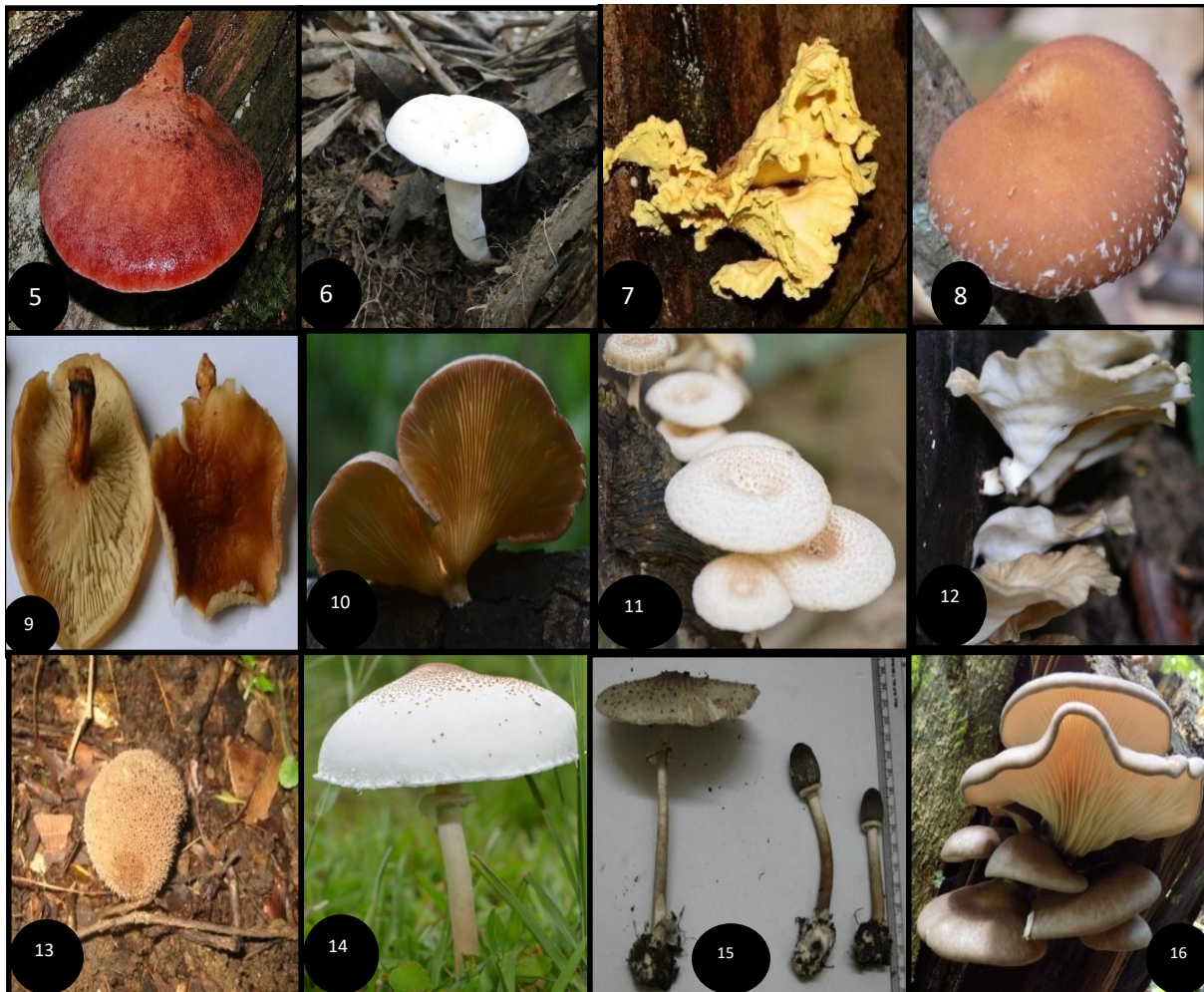
Photoplate (1-14) | 1. Lactifluus corrugis ; 2. Auricularia auricula-judae ; 3. Cantharellus cibarius ; 4. Craterellus cornucopioides ; 5. Fistulina hepatica ; 6. Lactarius piperatus ; 7. Laetiporus sulphureus ; 8. Lentinula edodes ; 9. Lentinula lateritia ; 10. Lentinus polychrous ; 11. Lentinus tigrinus ; 12. Lentinus sajor-caju ; 13. Lycoperdon perlatum ; 14. Macrolepiota dolichaula ; 15. Macrolepiota procera ; 16. Pleurotus ostreatus .

Cap upto 30 cm across, irregular in shape but often fan-shaped or tongue-like, sometimes fused laterally with other caps, velvety, or fairly smooth, the margin lobed, red, reddish orange, or liver colored. Pore Surface whitish or pale