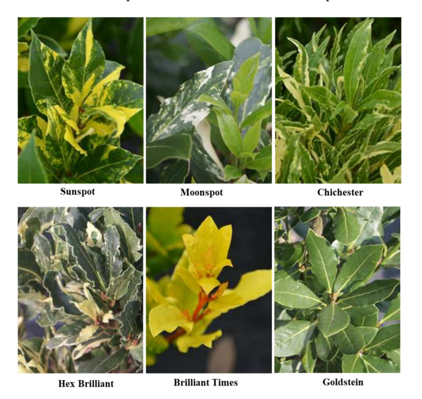
Figure 2. Variation in leaf morphology of some of the L. nobilis L. cultivars.

According to gardeners' preference, most of these cultivars are developed by commercial nurseries, like "Sunspot," a cultivar with gold-variegated foliage, and "Brilliant times," with a reddish stem with bright yellow leaves. There is an urgent need to develop the L. nobilis genebank for the collection, documentation, regeneration, distribution, and conservation of genotypes worldwide. The germplasm must be collected from diversityrich areas of the world to enrich the genetic resources. It will act as a reservoir of useful genes and alleles, contributing to the genetic enhancement and providing raw material for further improvement programs. Several studies have been conducted on the L. nobilis