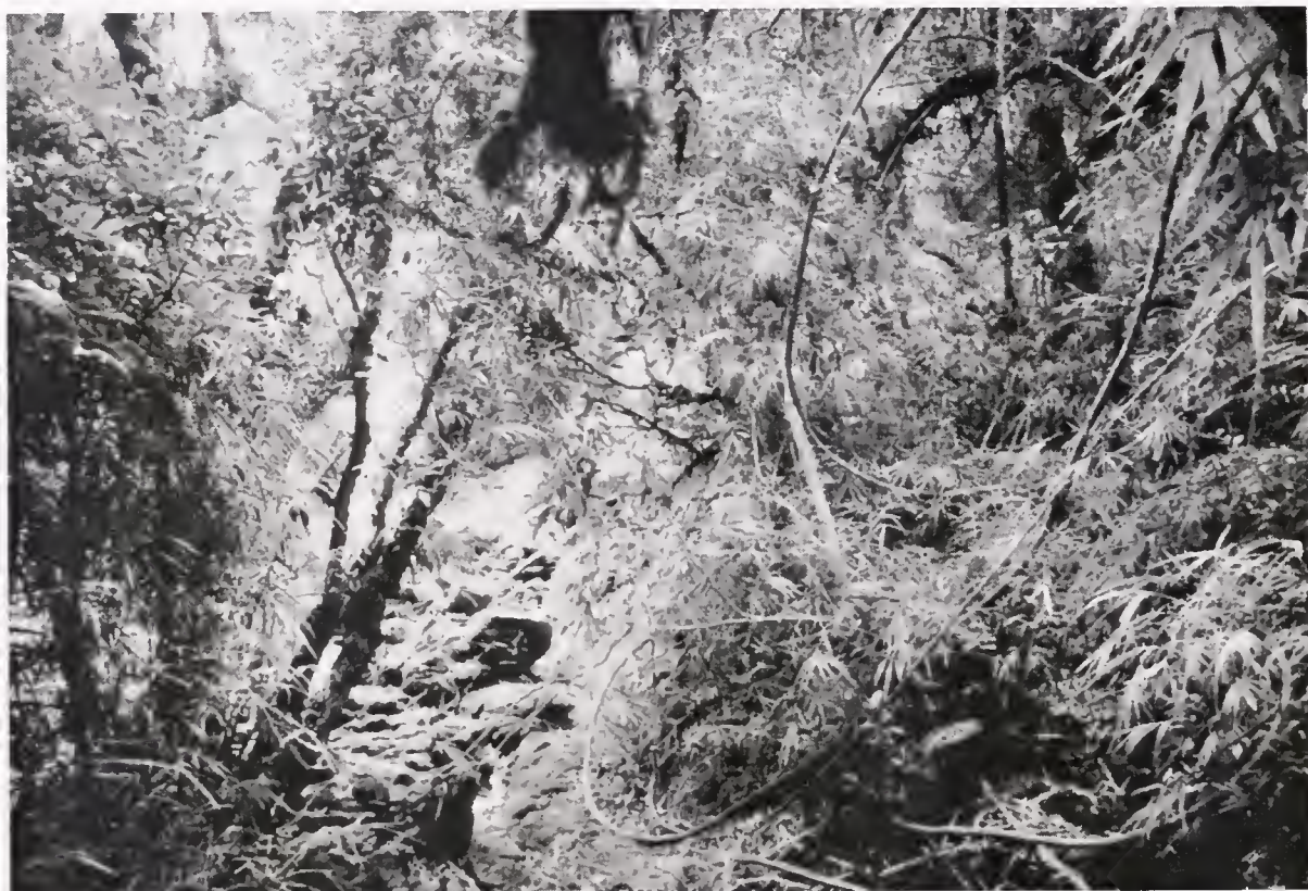
Fig. 4. Cloud forest habitat of Pseudorabdion talonuran at the type locality: Mt. Madja-as, Antique Province, Panay Island, Philippines.

loreal (or if a small scale is present in the loreal position, a rare occurrence among this group, it is neither elongate nor does it border the orbit), P. oxycephalum , P. ater , and P. montanum are confined to the Philippines, P. eiselti is known only from the type locality at Padang, Sumatra, and P. longipes has been collected at many localities on the islands of Borneo, Sulawesi, Nias, and Sumatra, from Singapore and elsewhere north along the Malay Peninsula, from the Riau (Riou) Archipelago, and as far north as Ban Gnara and Patani, in southern Thailand.