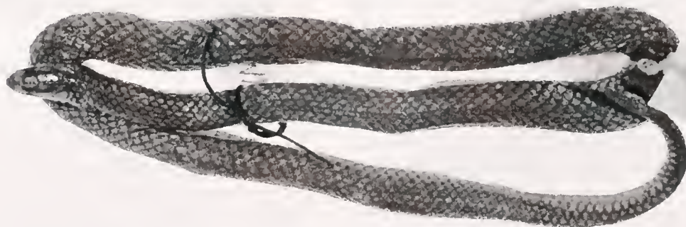
Fig. 3. Dorsal view of holotype (PNM 2712) of Pseudorabdion talonuran .

Five species ( P. longiceps , P. ater , P. oxycephalum , P. eiselti , and P. montanum ) lack the loreal (lori-ocular); the prefrontals are in contact with the second and third upper labials. Of the forms lacking a distinct