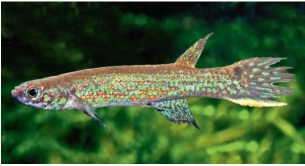
Fig. 3. Rivulus staecki spec. nov., live adult male (from type locality) of approx. 28 mm SL in aquarium. Not preserved, no type specimen. Caudal fin partly damaged.