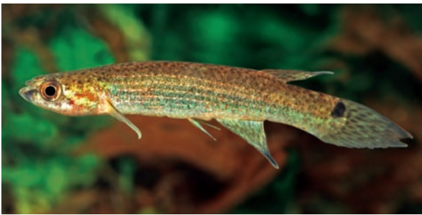
Fig. 4. Rivulus staecki spec. nov., live adult female (from type locality) of approx. 24 mm SL in aquarium. Not preserved, no type specimen. Caudal fin dorso-ventrally compressed.