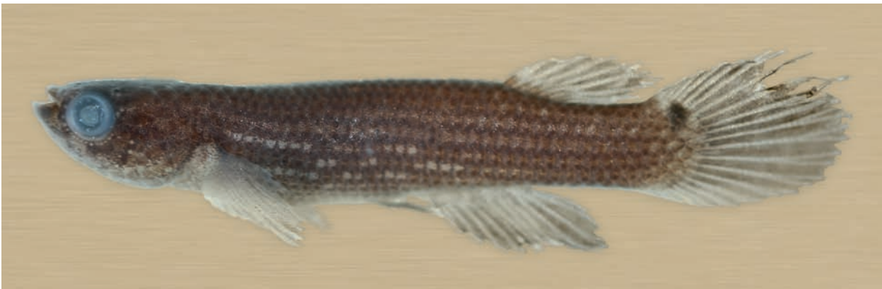
Fig. 2: Largest preserved female paratype of R. staecki spec. nov.

usually living in forest creeks, shallow ponds and swamps. According to COSTA (2006) the subgenus Owiye is a monophyletic unit. Its major diagnostic characters are the transversally arranged frontal scales (S-patterned) and a transverse stripe through the chin (COSTA, 2006).