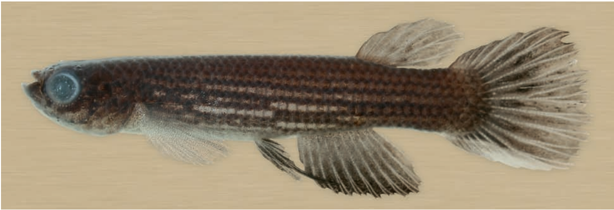
Fig. 1. Holotype (male) of R. staecki spec. nov.