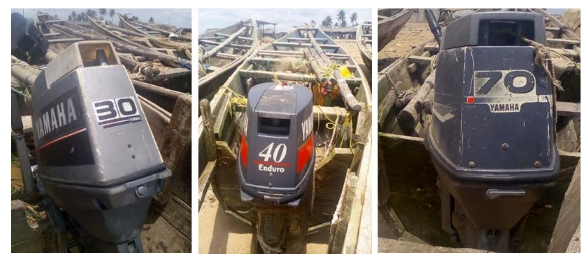
Figure 2. Types of Outboard Engine in use in Ilaje Community, Badagry.

Figure 1. Plank canoes used at the Ilaje Community, Badagry.