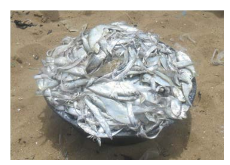
Figure 9. A basin of bycatches canoe carriers.