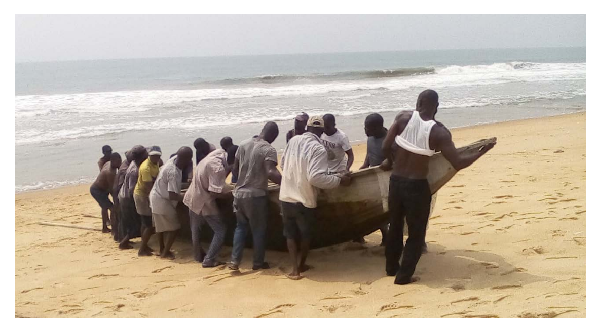
Figure 5. A canoe being manually lifted from the water to the sand beach.