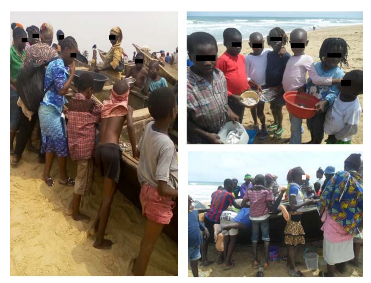
Figure 6. Children picking by-catches.

As stated in Table 5, trawl net and twine ( Iro ) used in fishing costs between $194.44-$200, while the cost of constructing a canoe ranges between $305.56-$416.67 A motorized engine with cash at hand costs $166.67-$4166.67 but the same type of engine is bought for $5055.56-$5555.56 at high purchase , with the horse power of the engine is a sole factor for high price. At the rate of $0.40 per litre, 50-120 litres of fuel per canoe varying on the distance covered off shore is being used during fishing for shrimp or fish. $5.56 is paid per annum for leasing of land to Landlords, who are documented owners of the land.