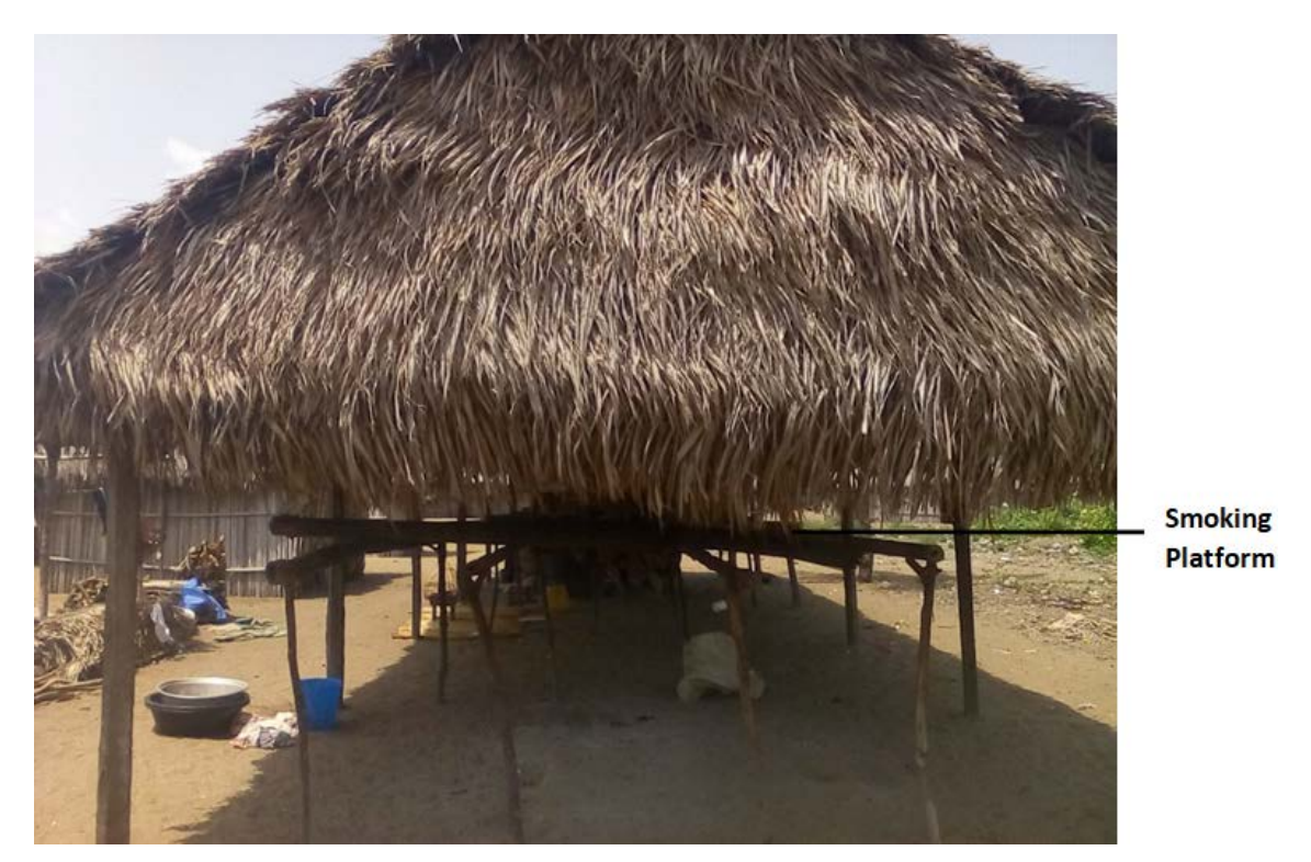
Figure 4. Shrimp smoking house.

Min=Minimum, Max=Maximum, S. D=Standard deviation.