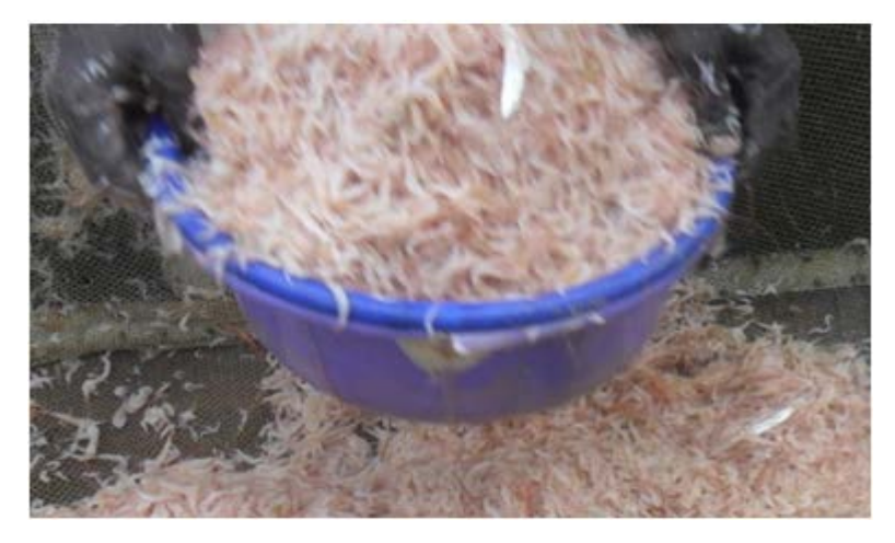
Figure 8. One Kampala of crayfish given to canoe carriers.