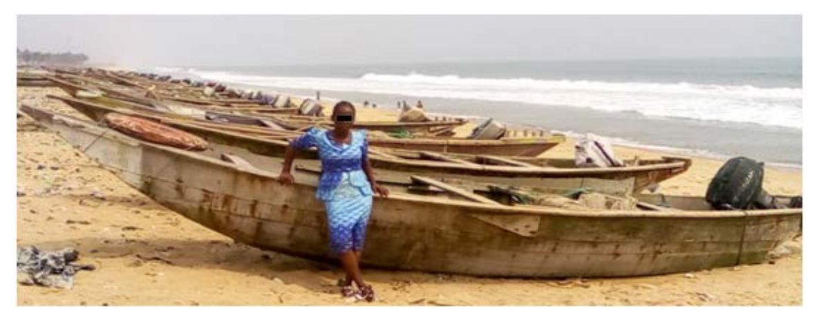
Figure 1. Plank canoes used at the Ilaje Community, Badagry.

*Min = Minimum, Max = Maximum, S. D. = Standard deviation.