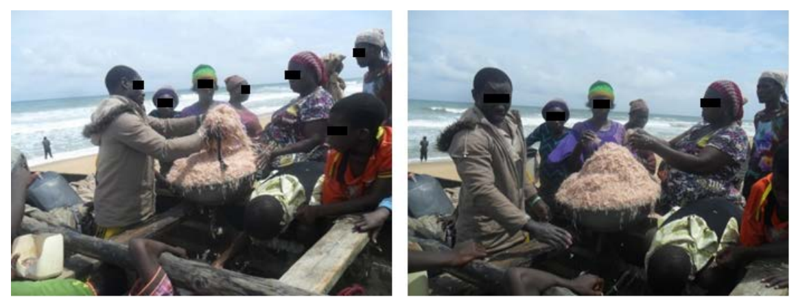
Figure 7. Measurement of crayfish in basins.

Table 6 . Selling price of fresh Crayfish per basin.