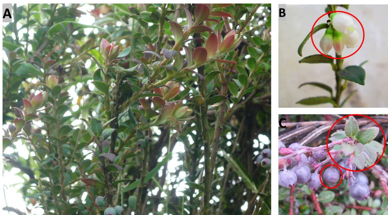
Figure 3. Mortiño plant ( Vaccinium floribundum Kunth) with its floral primordia (A), A small bunch of flowers with some pigmentation (B), Serrated leaves and its ripe berries (C).

During its development, the fruit color transitions from green to white-pink, to pink, and finally to blue-black [16]. Fruit development after anthesis takes roughly between 60 and 100 days under natural conditions [17]. Taxonomically, V. floribundum has traditionally been classified within the Pyxothamnus section in the genus Vaccinium along with V. consanguineum and V. ovatum . However, phylogenetic analysis of tribe Vaccineae suggested Vaccinium is not monophyletic with V. floribundum , forming a clade along with V. consanguineum and V. meridionale , separate from other Vaccinium spp. [17].