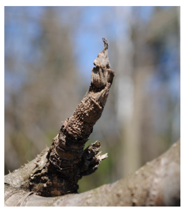
Fig. 2. Freeze-damaged branch of Aralia mandshurica

Another case of branch frost-demage was fixed in Eleutherococcus senticosus on the territory of the M. M. Gryshko NBG (Fig. 4).