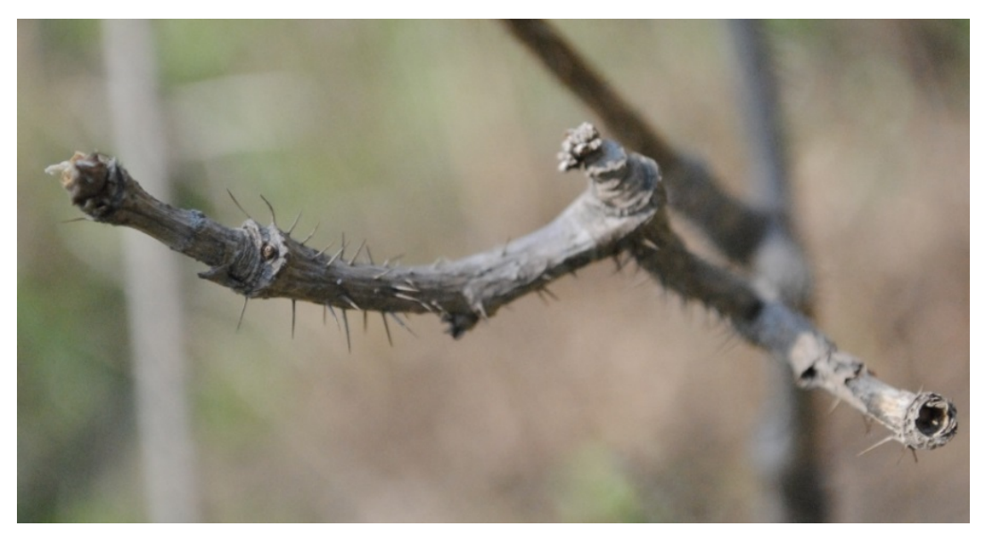
Fig. 4. Branch freezing of Eleutherococcus senticosus