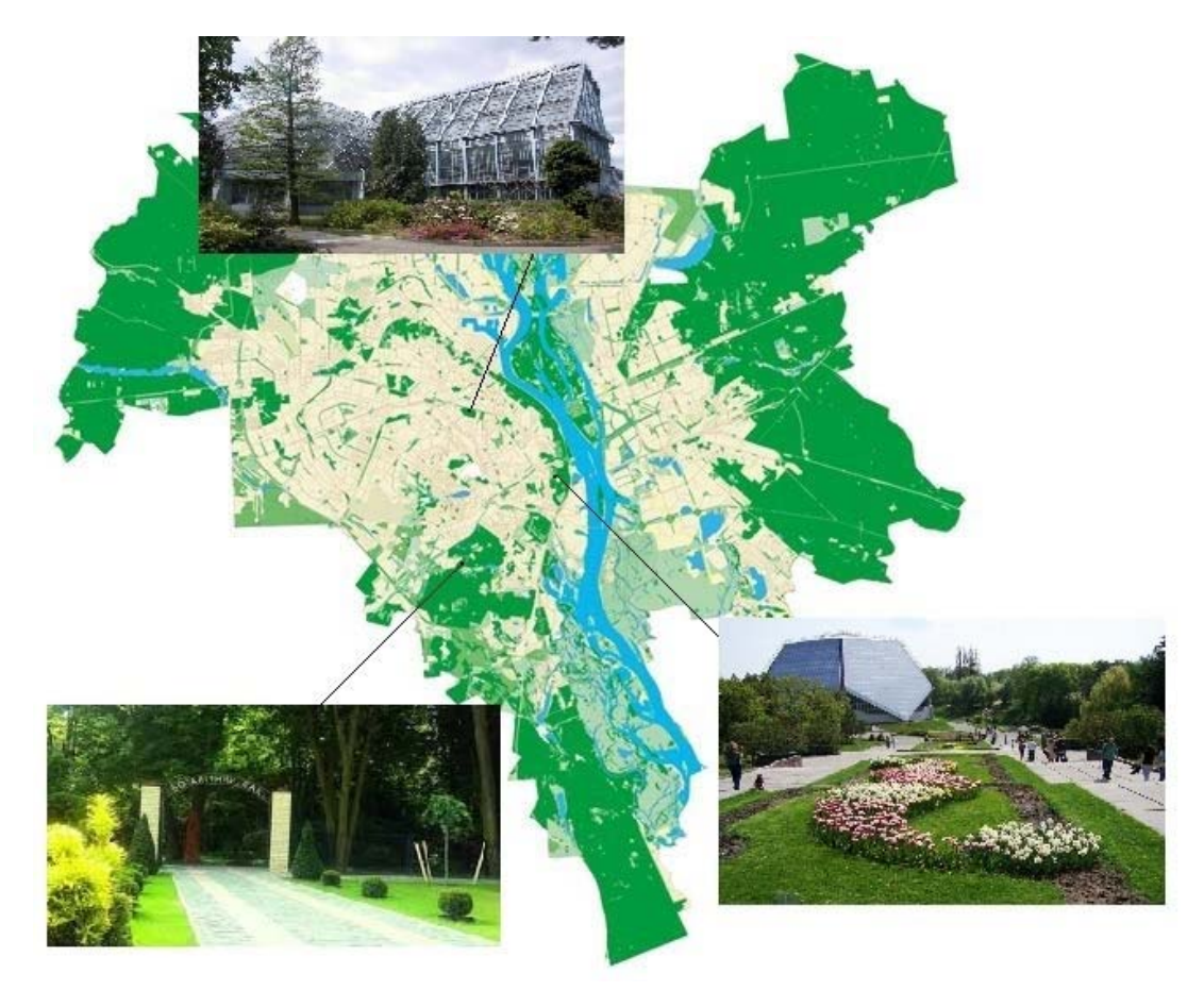
Fig. 1. Location of Botanical gardens on the territory of Kiev: 1 – A. V. Fomin Botanical Garden of Kyiv National T. Shevchenko University; 2 – M. M. Gryshko National Botanical Garden of National Academy of Science of Ukraine; 3 – Botanical Garden of National University of Life and Environmental Sciences of Ukraine

The data of the average monthly temperature was used from the web-site of Central Geophysical Observatory of B. I. Sreznevsky [http://www.cgo.kiev.ua/]. The change in the minimum average annual temperature prevails over the maximum.