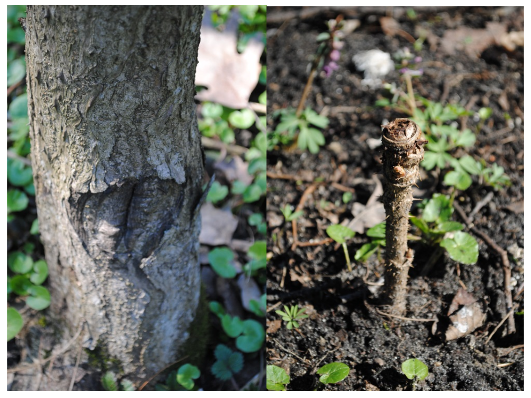
Fig. 3. Frost cleft and brunch freezing of Aralia mandshurica