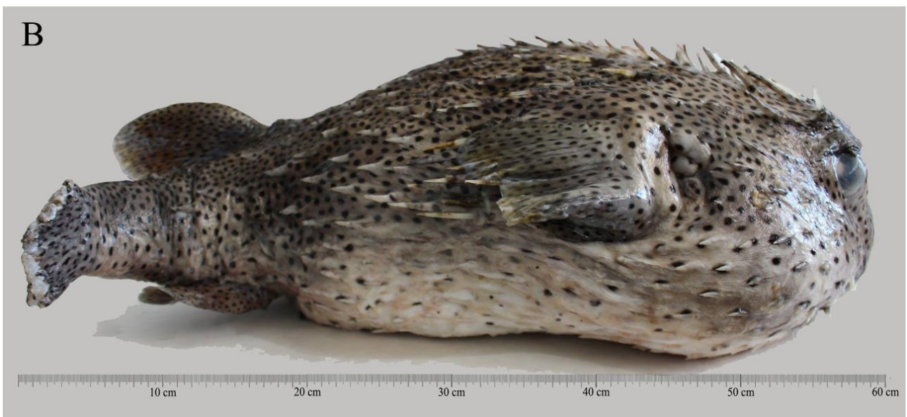
Figure 1. (A) Map with the confirmed records of Diodon hystrix in the Mediterranean, (B) Caught specimen reported in this study.