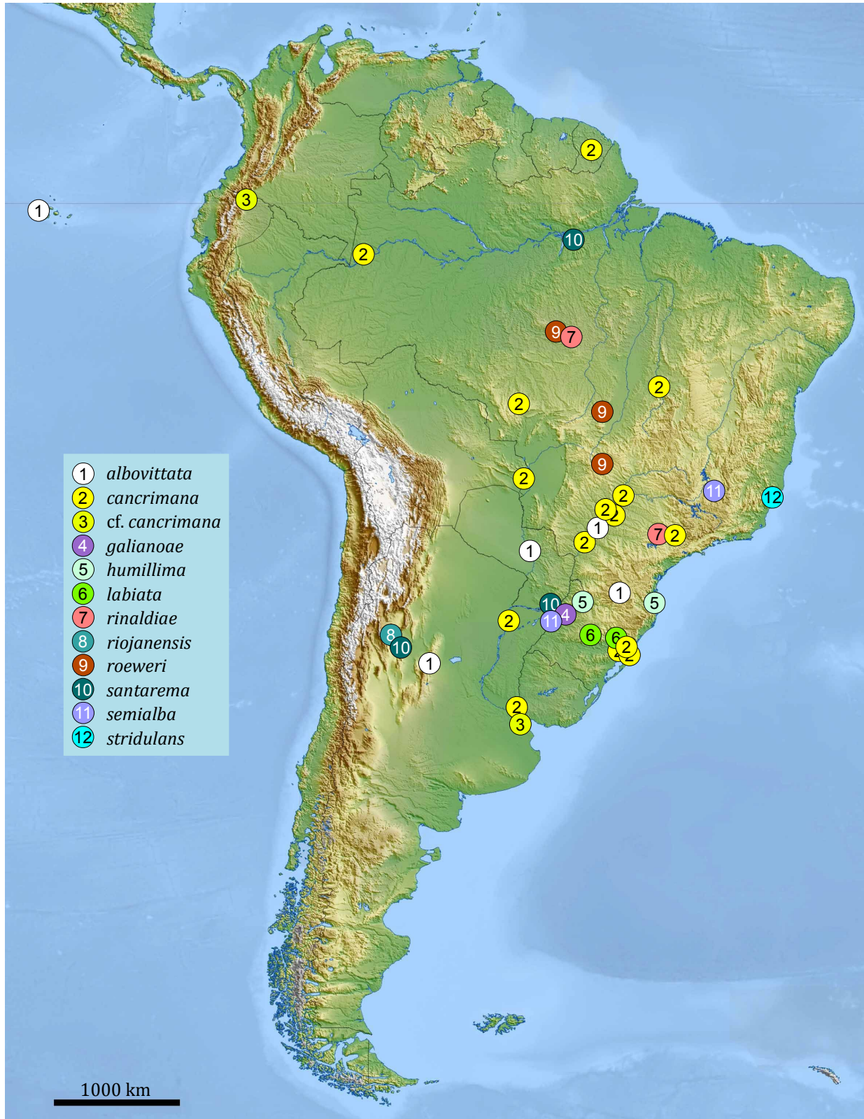
Figure 2. Distribution of Helvetia species, all endemic to South America. Localities shown here are listed with respective references in Appendix 1. Map by Mapswire.com ( https://mapswire.com ), used subject to a Creative Commons Attribution 4.0 International (CC BY 4.0) License.

Although the genus Helvetia Peckham & Peckham 1894 is widely distributed in South America (Figure 2), these spiders are not commonly found (Ruiz & Brescovit 2008).