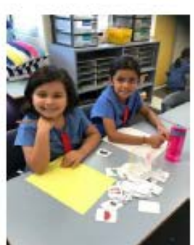
All about you