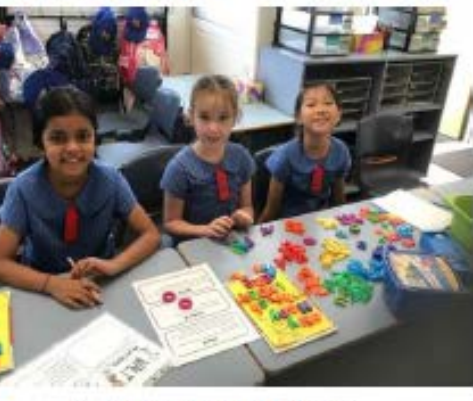
Say it, make it, write it