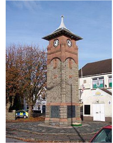
Hirwaun War Memorial

Hirwaun has an industrial heritage which the Hirwaun Ironworks were the centre of. After the ironworks closed coalmining became the prominent employment for the residents in Hirwaun until the late 20 th century.