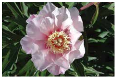
Ballarena de Saval (TOH) $50 (Tolomeo, 2001)

Pale lavender, single, midseason, 32" tall, intersectional. A delicate lavender flower with color intensifying in the center. Outstanding landscape plant.