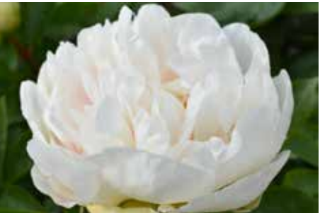
Greenland (Pehrson/Seidl, 1989)

Vibrant pink, semi-double, early to midseason, 30" tall, hybrid. Clean foliage, some side buds.