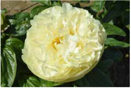
Yellow Bird (Johnson/Adelman, 2019)

Pink, double, fragrant, late, 39" tall, lactiflora. Lively pink outer petals with a fluffy mounded ivory-pink center. Named for its size and fragrant too!