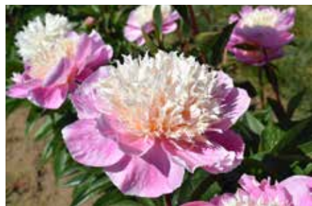
Victoria's Powderpuff NEW $40 (Tolomeo/Adelman, 2019)

Bright rose-pink, double, very fragrant, late-midseason, 34" tall, lactiflora. Vivid deep pink double with the outside of petals slightly lighter in color.