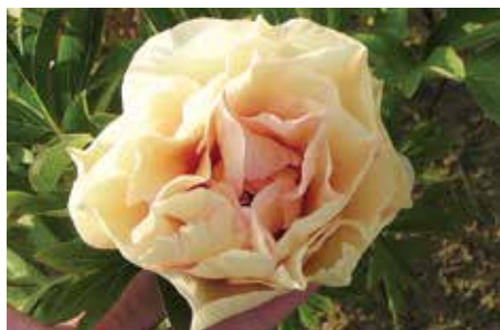
Canary Brilliants (Anderson, 1999) ALM $55 ITOH

Creamy yellow with apricot hues in center, semi-double to double, lightly fragrant, midseason, 28" tall, intersectional. A wonderful color combination with healthy foliage.