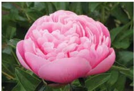
Etched Salmon ALM $38 (Cousins/R. Klehm, 1981)

Light pink to blush, double, fragrant, midseason, 30" tall, lactiflora. Flowers in a delicate very light pink color to white with yellow glow emitting from the center.