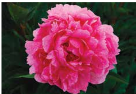
Pietertje Vriend Wagenaar (Friend, 1996)

White to Blush, double, midseason, 34" tall, lactiflora. Each bloom is an individual. Red streaks mark the bud before it opens but the bloom presents its red coloration as it pleases blotches, spots, stripes.