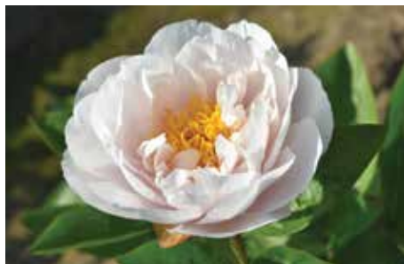
Blushing Princess (Saunders/Reath/Rogers, 1991) $45

Pale lavender, single, midseason, 32" tall, intersectional. A delicate lavender flower with color intensifying in the center. Outstanding landscape plant.