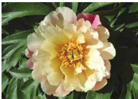
Joanna Marlene ITOH $60 (Anderson, 1999)

Chocolate red, japanese, midseason, 36" tall, lactiflora. An unusual color combined with an unusual flower form will make a focal point in your Spring flower bed.