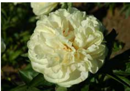
Sunny Boy (Laning, 1985) RARE $250

Red, single, midseason, 32" tall, intersectional. Ranging from red and white stripes to a solid strawberry color with curly yellow stamens centered with strawberry carpal tips. Every flower is a marvel in color!