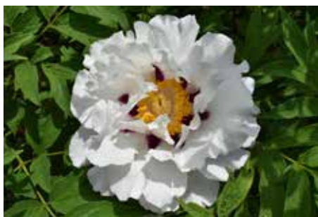
Angel Choir (Anderson, 1999)

Other growers use a quick way to increase tree peonies by grafting a piece from the parent plant onto a piece of herbaceous root to provide a quick-start energy supply for the tree peony. Sometimes the vigorous herbaceous root takes over to the detriment of the tree peony. In some cases the herbaceous will come up and bloom beside the tree peony. Own-root peonies are also an advantage if the top is damaged by severe freezing or accidental cut down the root will send up more buds and stems that will be the same variety as planted.