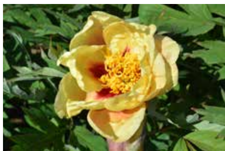
Prince William NEW $125 (not registered)