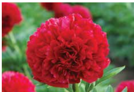
Red Grace $28 (Glasscock, 1980)

Deep red, bomb, fragrant, midseason, 32" tall, hybrid. The same color as Red Charm but with a flower so tightly petaled it is almost a complete globe. One large flower per stem.