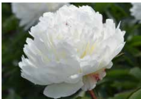
Evening Star RARE $40 (Sass/Interstate Nurseries, 1937)

Pink, bomb, midseason, fragrant, 20" tall, lactiflora. Dark pink Bomb form flowers with rounded, shallowly notched guard petals. Nice dark green foliage.