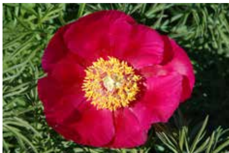
Fernleaf Hybrid $24 (hybridizer unknown)

Rose-pink, japanese, late, 32" tall, lactiflora. A center poof of slightly lighter pink petals is surrounded by golden staminodes. A real charmer!