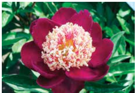
Sword Dance ALM $24 (Auten, 1933)

Red, japanese, late, 34" tall, lactiflora. The center petaloids are edged in white on a brightly colored flower. A very striking flower that stands out in the garden.