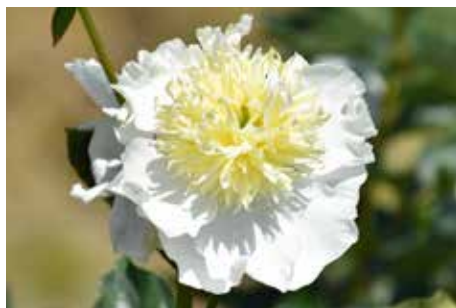
Marshmallow Tart $32 (R. Klehm, 1985)

White, double, midseason, 24" tall, lactiflora. Creamy puffball white with yellow petals at the base. Shorter plant with strong plant habit.