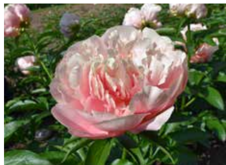
Pastelorama NEW $200 (Seidl/Bremer, 2013)

Carmine-red, semi-double, midseason, 20" tall, hybrid. A glowing red, tulip shaped flower on a rounded, tidy, dwarf plant suitable for borders.