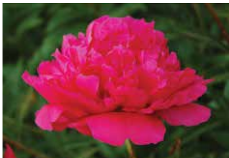
Felix Supreme $22 (Kriek, 1955)

Pink, semi-double, early, 34" tall, hybrid. Salmon pink flowers can vary from single to semi-double in young plants. Mostly semi-double and a few doubles in older plants. Upright habit with pollen and seeds.