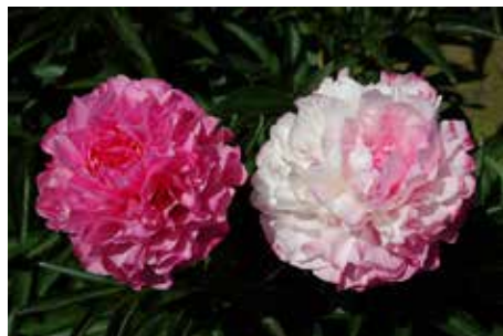
Joker $34 (Landis/Rogers, 2004)

Red, japanese, midseason, 36" tall, lactiflora. A deep red flower with feathery petals in the center. It draws visitors into the flowerbed for its delicate but bold statement.