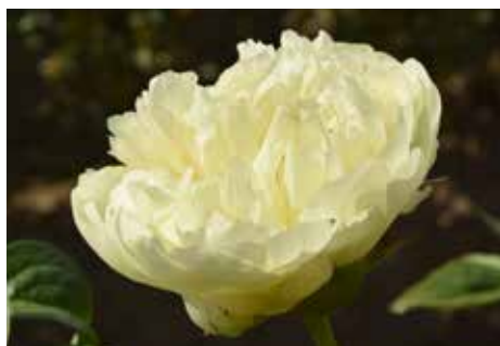
Vanilla Schnapps $120 (Seidl/Bremer, 2013)

Yellow, semi-double to double, fragrant, early, 36" tall, hybrid. Sturdy plant with dark green foliage. Light yellow rounded petals have an irregular toothed edge.