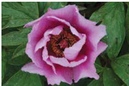
Anna Marie (Seidl, 1984)

White, semi-double, early, 36" tall, suffruticosa tree peony. Beautiful clear white with contrasting purple flares. Blooms generally held high up above the foliage.