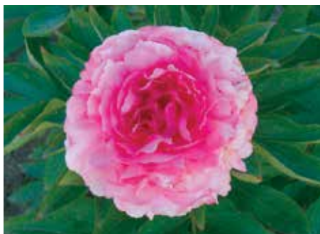
Rose Heart $68 (Bockstoece/Landis, 1974)

Red, semi-double, midseason, 32" tall, hybrid. A blood red flower with ruffled petals really attracts attention. Very attractive in bud. Strong stems.