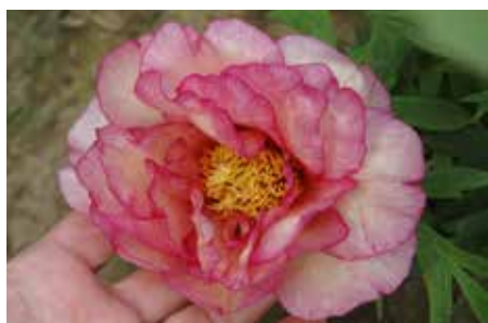
Right Royal RARE NEW $120 (Saunders, 1950)

Creamy rose, single, early, fragrant, 36" tall, lutea hybrid tree peony. Excellent amount of bloom. A very appealing color with darker center flares and red sheath covering. APS Grand Champion 1991.