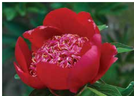
Walter Mains $28 (Mains, 1957)

Red, bomb, midseason, 32" tall, hybrid. An unusually brilliant clear red that draws you into the garden. Sturdy stems.