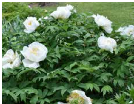
Ice Storm $65 (Smithers, 1992)

Yellow, semi-double, fragrant, early, lutea hybrid tree peony. A robust yellow flower with dark center flares. Late summer blooms sometimes appear. APS Gold Medal 1989.