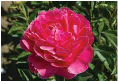
Rozella (D. Reath, 1990)

Pink, double, fragrant, late, 36" tall, lactiflora. Double flowers of soft seashell pink with petals edged a trifle lighter with a few crimson flecks. Grandma's favorite pink double.