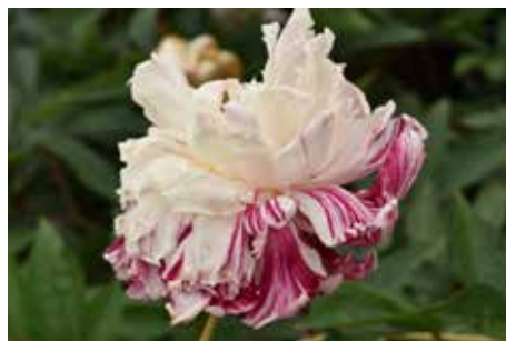
Independence Day RARE $80 (Kornder, 1999)

Yellow, semi-double, midseason, 30" tall, intersectional. A delightful flower that changes color as it matures. A lovely landscape plant.