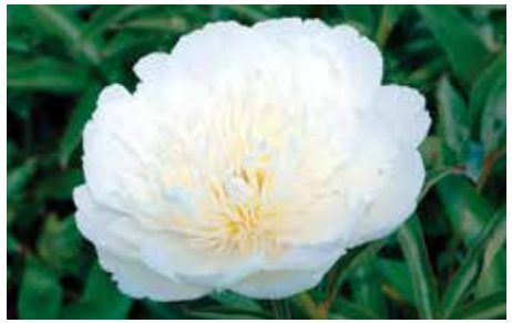
Bride's Dream $22 (Krekler, 1965)

Pink, japanese, very fragrant, midseason, 32" tall, lactiflora. Pink outer petals surround a creamy center. When vigorous it may send rose petals bursting from center!