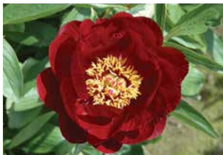
John Harvard RARE $50 (Auten, 1939)

White with pink striping, double, midseason, 34" tall, lactiflora. Light pink to white petals with magenta candy striping, predominantly towards the outside of the bloom. Blooms held well, rarely found in trade.