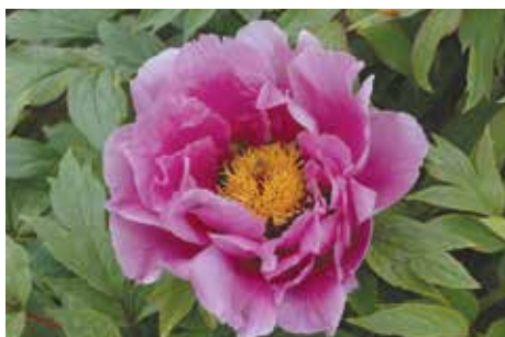
Ofuji Nishiki (Japan)

Pale pink, semi-double to double, early, 30" tall, lutea hybrid tree peony. Pale pink to creamy white blooms. Blooms set up on top of foliage.