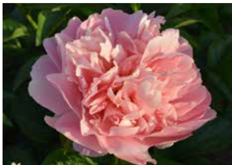
Faithful Dream $150 (Stanek, 2014)

Pink, semi-double, early, 34" tall, hybrid. Salmon pink flowers can vary from single to semi-double in young plants. Mostly semi-double and a few doubles in older plants. Upright habit with pollen and seeds.