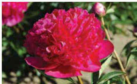
Felix Crousse $18 (Crousse, 1881)

Magenta, single, very early, 24" tall, hybrid. The fern-type foliage is a wonderful compliment to the landscape. Our best growing fernleaf peony.