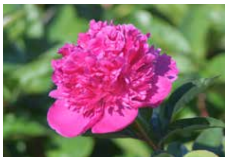
Embraceable Glory NEW $85 (Adelman, 2019)

Pink, bomb, midseason, fragrant, 20" tall, lactiflora. Dark pink Bomb form flowers with rounded, shallowly notched guard petals. Nice dark green foliage.