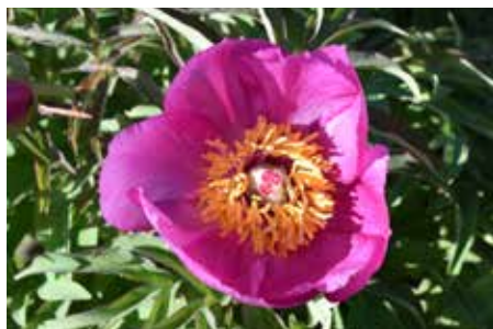
Tinkerbelle NEW $32 (Krekler/R. Klehm, 1985)

Yellow, double, lightly fragrant, early, 32" tall, hybrid. A large, butter-yellow, full double peony. The flowers are so large that the stems need support. Our guests rave about it.