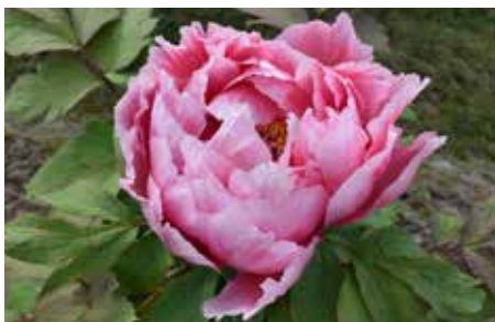
Seidai $50 (Not registered)

Red to yellow, semi-double, early, lutea hybrid tree peony. Blooms are a yellow heavily overlaid by a strawberry red color. The red coloring can fade out to leave mostly yellow petals with strong red colored edging. Saunders variety that is not widely in trade.