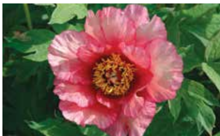
Ruffled Sunset $80 (D. Reath, 1988)

Red, single, very early, 34" tall, lutea hybrid tree peony. Copper-red flowers with great simplicity on a lovely landscape bush.