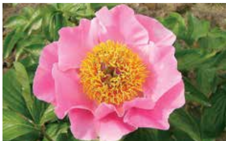
Sugar 'n Spice (Rogers, 1988) $34

Light yellow, single, midseason, 33" tall, intersectional. The bloom opens apricot color and fades to a lively yellow. The plant has generous blooms and attractive leaves.