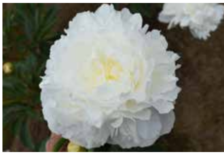
Madame Claude Tain (Doriat, 1927)

White, double, lightly fragrant, midseason, 32" tall, lactiflora cultivar. A white, bomb-type double with mild fragrance. Plant stands up nicely. One of my special favorites.