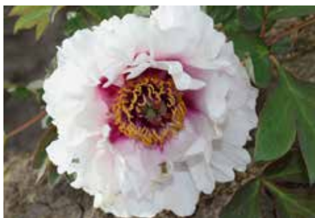
Rosalind Elsie Franklin $90 (Seidl, 1996)

Yellow, semi-double, early, advanced generation lutea hybrid seedling. Not registered with APS. Garden named seedling by Bernard Chow of Australia, seedling # 153, named for Bill Seidl. Yellow petals with red flares.