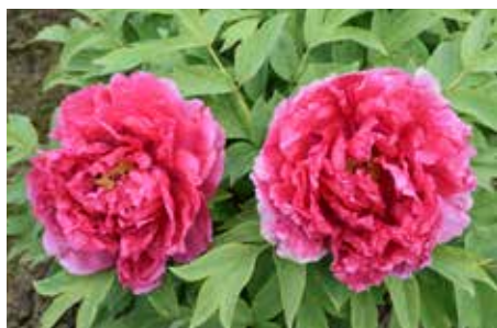
Hana Daijin NEW $80 (Japan, bef. 1910)

Bright yellow, semi-double to double, early, lutea hybrid tree peony. Bright yellow with deeper orange tone flares, flower form can vary from semi-double to double.