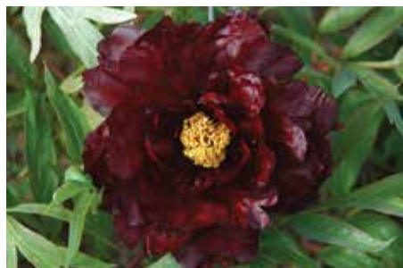
Black Panther (Saunders, 1948)

Yellow, full semi-double, fragrant, early, 30" tall, lutea hybrid tree peony. Bright lemon-yellow with tightly packed petals that hang down on a short bush.