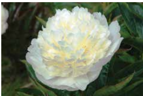
Carolina Moon (Auten, 1940) RARE $36

Scarlet, single to semi-double, early, 33" tall, hybrid. Scarlet petals cupped around a small yellow center. Nice cut flower with brilliant color.