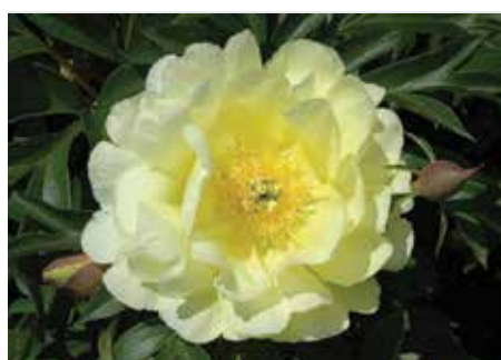
Smith Family Yellow ITOH $70 (D. R. Smith, 2002)

Red, double, fragrant, late-midseason, 36" tall, lactiflora. Outer 3 rings of petals are larger than center petals. Strong stems and a good cut flower.