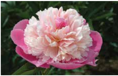
Bowl of Beauty $20 (Hoogendorn, 1949)

Pink, japanese, very fragrant, midseason, 32" tall, lactiflora. Pink outer petals surround a creamy center. When vigorous it may send rose petals bursting from center!