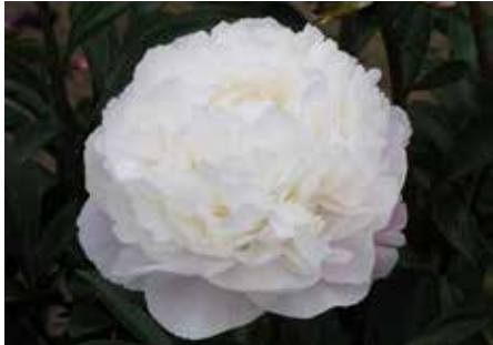
White Frost $32 (D. Reath, 1991)

White, japanese, very fragrant, midseason, 36" tall, lactiflora. Fragrance wins on this flower with yellow to fluffy white centers! Stands upright.