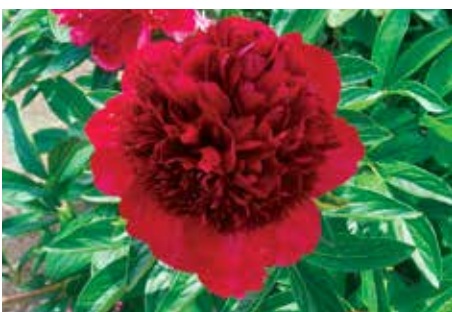
Red Charm $26 (Glasscock, 1944)

White, double, lightly fragrant, midseason, 34" tall, lactiflora. Blooms delicately light flowing, creamy white petals with a light pink glow at the center.