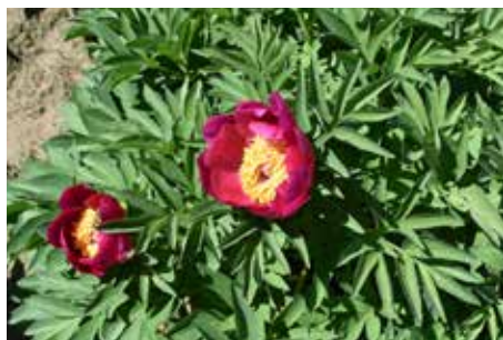
Happy (R. Klehm, 2016) NEW $36 Red, single, very early, 15" tall, hybrid. Mounding plant form for great for garden borders or addition to a rock garden.