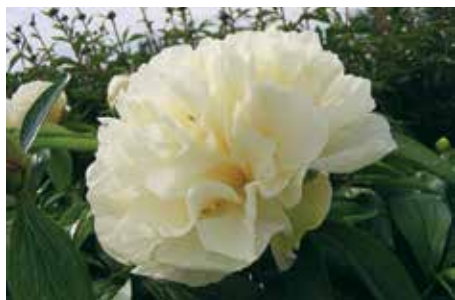
Sunny Girl $36 (Laning, 1985)

Yellow, double, lightly fragrant, early, 32" tall, hybrid. A large, butter-yellow, full double peony. The flowers are so large that the stems need support. Our guests rave about it.