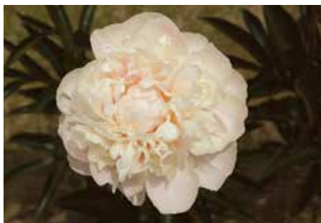
Summer Glow (Hollingsworth, 1992) $80

Yellow, double, midseason, 30" tall, intersectional. A large yellow bloom that will astound your visitors. The red flares in the center vary in prominence. Side buds are present providing a long bloom season. A multitude of light red carpal tips in the center provide additional interest. A 'must have'.