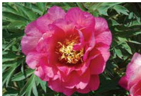
Hillary (Anderson, 1999) ALM ITOH $48 Creamy red, semi-double, midseason, 30" tall, intersectional. Red fades to cream white holding its darker center color. Graceful foliage that holds the flowers on display.