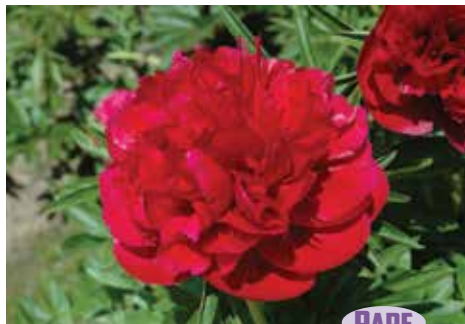
P. officinalis rubra plena (Species) RARE $32

Brick-red, single, midseason, 32" tall, intersectional. A fast increasing plant with delightful brick-red flowers. Lovely landscape plant with robust dark green color.