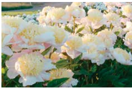
Polar Star $20 (Sass, 1932)

Coral, semi-double, fragrant, early, 34" tall, hybrid. Opens a redder coral than other corals, with notched petal edges and a center of yellow stamens. APS Gold Medal 2000.