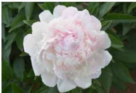
Fairy's Petticoat NEW $32 (C. Klehm, 1970)

White, semi-double to double, midseason, 28" tall, lactiflora. May have red streaking on outer petals at times. Deep green foliage, wonderful landscape plant.