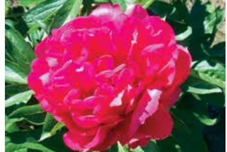
Ellen Cowley ALM $22 (Saunders, 1940)

Creamy-white, double, very fragrant, midseason, 34" tall, lactiflora. Globe-shaped, creamy-white flower with green carpels and a yellow center glow. A much loved old favorite!