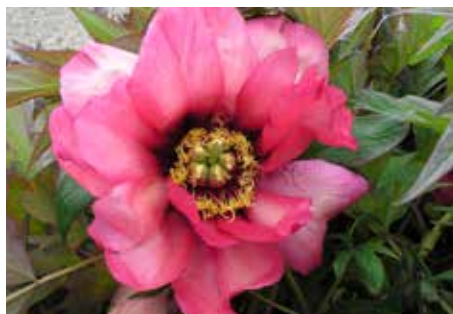
Tiger Tiger $70

Pink & orange blooms, single, early, 48" tall, lutea hybrid tree peony. Exciting plant that booms with two distinctive colors. Pleasing foliage, from Bill Seidl seed.