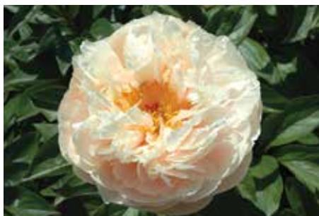
Pastelegance $165 (Seidl, 1989)

Pink, japanese, midseason, 36" tall, lactiflora. A creamy mix of pink-yellow stamenoids glow inside cupped jaunty pink petals.