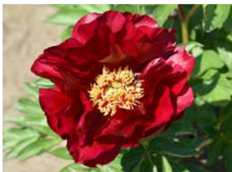
Chief Justice $38 (Auten, 1941)

White, crown double, lightly fragrant, early, 36" tall, lactiflora. Large outer petals surround white center glowing yellow from inside.