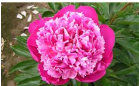
Pink Derby (Bigger, 1966)

Red, double, midseason, 34" tall, lactiflora. Large deep red petals, yellow stamen may be visible dispersed within petals at full bloom. Hard to find.