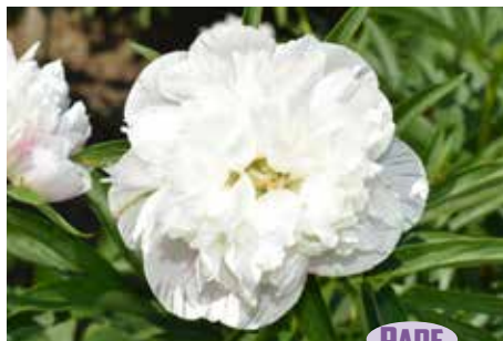
P. officinalis alba plena (Species) RARE $40

Dark velvet red, double, lightly fragrant, midseason, 36" tall, hybrid. The plant has strong stems and healthy, dark green foliage. The most regal of reds. APS Gold Medal 1997.