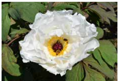
Phoenix White (China, unknown)

Yellow with a blend of red, single, fragrant, early, 60" tall, lutea hybrid tree peony. A blend of colors alight with sunlight drawing you to its center. Blooms nicely for viewing.