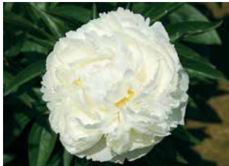
Bowl of Cream $22 (C. Klehm, 1963)

White, japanese, midseason, 34" tall, lactiflora. An all white flower with abundant thin petaloids filling the center. Will stand up nicely in spring rain.