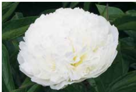
Luxor (Sass, 1933)

Magenta, japanese, fragrant, midseason, 34" tall, lactiflora. A rich, glistening magenta flower that stands upright. Unusual flower form and color.