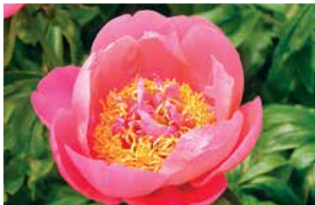
Ann Berry Cousins (Cousins, 1972)

Pink, double, very fragrant, late-midseason, 32" tall, lactiflora. Rose-type flower with a deep pink hue on strong stems.