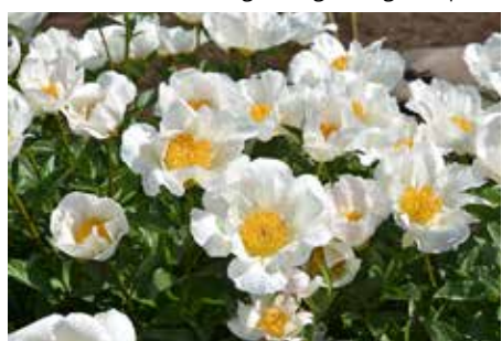
Krinkled White (Brand, 1928)

Red, double, midseason, 36" tall, lactiflora. This is the true variety, dug from Rosenfield's granddaughter's garden.