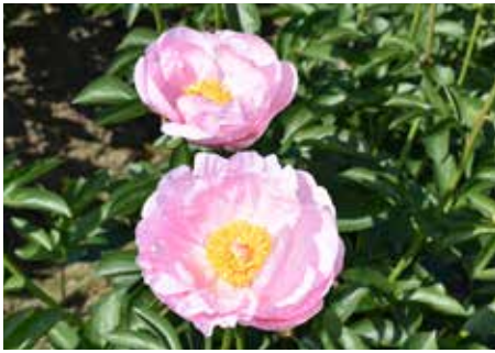
Dreamtime NEW $160 (Seidl/Bremer, 2013)

Light pink, single, lightly fragrant, midseason, 36" tall, hybrid. A vigorous grower, with strong stems make it an excellent plant to add to your collection.