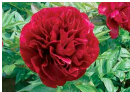
Red Satin $32 (Sass, 1937)

Deep pink, full double, lightly fragrant, early, 33" tall, hybrid. Outer petals fade while the tightly packed inner petals retain the deep pink color making a very unusual effect.