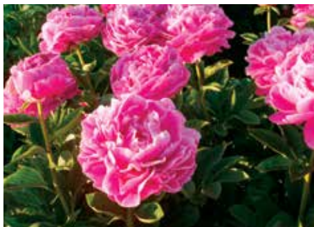
Pink Parfait $20 (C. Klehm, 1975)

White, japanese, fragrant, midseason, 36" tall, lactiflora. The white guard petals have a pink flush. The center is a mound of yellow staminodes creating a lacy pastel effect.