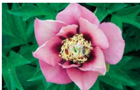
Old Rose Dandy (Laning, 1993) ITOH $42

White, double, early, 24" tall, species. Referred to "The White Memorial Day" peony. Blooms tend to sometimes have a touch of pink blush to them.