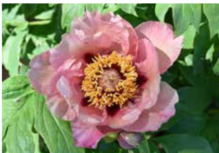
Nike (Daphnis, 1985)

White, single, very early, species tree peony. Flowers open up flat with veining shown throughout the petal surface.