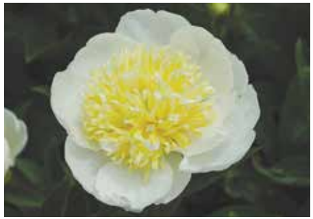
White Sands $26 (Wild & Son, 1968)

Watermelon red, semi-double, midseason, 34" tall, intersectional. Outstanding color! Terminal flower surrounded by side buds for a long bloom season. Striking cut foliage.