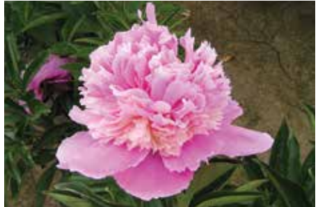
Whopper $30 (R. Klehm, 1980)

White, double, fragrant, midseason, 30" tall, hybrid. A lovely rose-type double that is very fragrant. It is held upright on strong stems. Buds streaked with red. Can be blush.