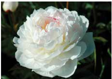
Avalanche (Crousse, 1886)

White, full double, very fragrant, late, 32" tall, lactiflora. Large, lovely, full double flowers need support. You'll love the rose fragrance!