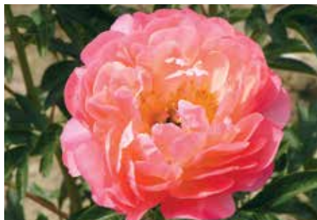
Coral Sunset $30 (Wissing/C. Klehm, 1965) ALM

Pink, japanese, fragrant, midseason, 32" tall, lactiflora. A creamy white lacy center is surrounded by two rows of large raspberry pink petals.