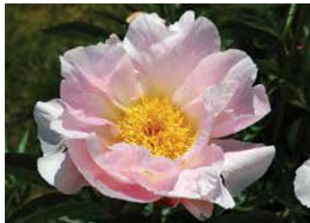
Chiffon Clouds $22 (R. Klehm, 1995)

Scarlet red, semi-double, lightly fragrant, midseason, 34" tall, hybrid. Striking color on a vigorous upright plant. Petal numbers may increase with plant maturity.