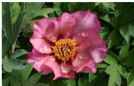
Sunrise Glow $350