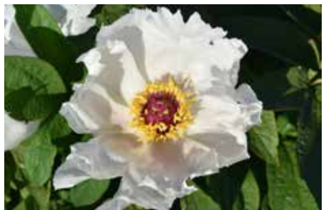
p. ostii (Species)

Pink with dark flares, semi-double, early, lutea hybrid tree peony. A simple beauty with medium pink veined petals centered with deep pink/red flares and filaments.