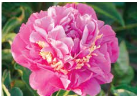
Feather Top $24 (Wild, 1970)

Ruby red, double, lightly fragrant, midseason, 34" tall, lactiflora. Frothy petals make it an excellent cut flower. Dark green foliage and strong growth habit.