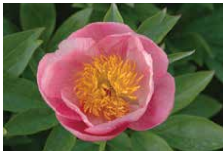
Roselette (Saunders, 1950)