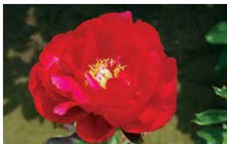
Cherry Ruffles $32 (Hollingsworth, 1996)

Red, semi-double, midseason, 32" tall, hybrid. Rich red color with showy stamens held upright.