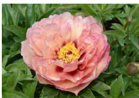
Kopper Kettle (Anderson, 1999)

Red, double, fragrant, midseason, 36" tall, lactiflora. Rose-type flowers of watermelon-red on strong dark green stems. APS Gold Medal 1957.