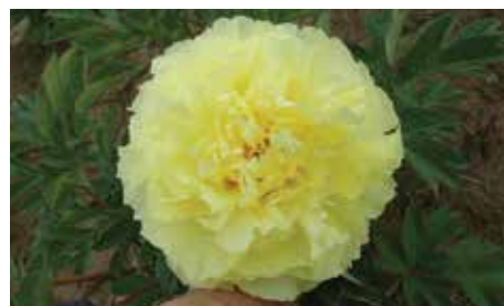
Sonoma Halo ITOH RARE $165 (Tolomeo, 2007)

Yellow, single, midseason, 35" tall, intersectional. Opening a rosy yellow and turning to clear yellow with small red center flares.