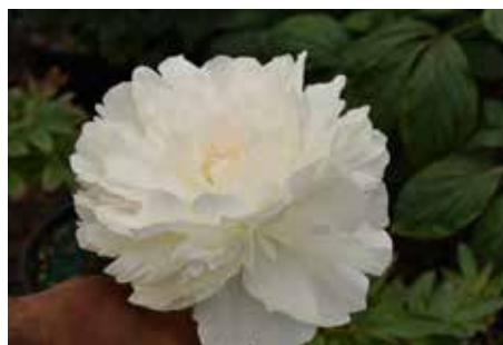
Puffed Cotton NEW $65 (Krekler/R. Klehm, 2003)

Pink, double, fragrant, midseason, 36" tall, lactiflora. Like a scoop of vanilla ice cream drizzled with raspberry topping. Distinctive coloring. Excellent cut flower.