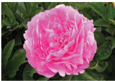
Vivid Rose $24 (C. Klehm, 1952)

Yellow, semi-double to double, fragrant, early, 36" tall, hybrid. Sturdy plant with dark green foliage. Light yellow rounded petals have an irregular toothed edge.