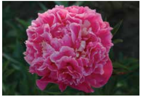
Edulis Superba $20 (Lemon, 1824)

Light pink, single, lightly fragrant, midseason, 36" tall, hybrid. A vigorous grower, with strong stems make it an excellent plant to add to your collection.