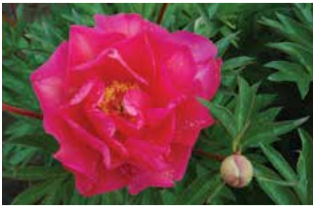
Watermelon Wine ITOH RARE $75 (Anderson, 1999)

Watermelon red, semi-double, midseason, 34" tall, intersectional. Outstanding color! Terminal flower surrounded by side buds for a long bloom season. Striking cut foliage.