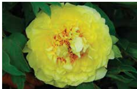
Alice Harding (Lemoine, 1935)

Lavender with darker flares, single, early, lutea hybrid tree peony. An elegant flower on a vigorous plant.