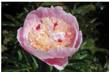
Orange Lace (Bigger, 1966) $28

Pink, single, early, 30" tall, hybrid. A delicate looking single bloom with deeper pink carpels in the center ringed with yellow stamens.