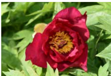
Icarus $85 (Daphnis, 1977)

Lavender/Pink, semi-double, early, 48" tall, suffruticosa tree peony. A rosy lavender suffruticosa cross made by Bill Seidl – unknown mudan x Baron Thyssen Bornemisza. Semi-double blooms with a hot pink ovary encompassed by dark flares bleeding to dark pink.