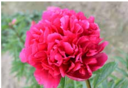
Topeka Coral $30 (Cousins/Bigger, 1975)

Red, japanese, late, 36" tall, lactiflora. Bright red petals surround an unusual arrangement of yellow staminodes streaked with red. An outstanding flower that draws attention.