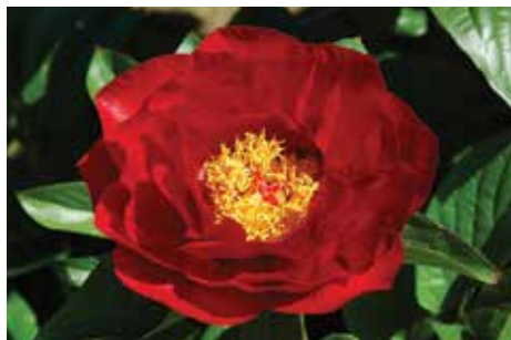
Mackinac Grand (D. Reath, 1992)

White, double, lightly fragrant, midseason, 34" tall, lactiflora. Flowers can vary blush to white, support may be needed. Popular used as a cut flower.