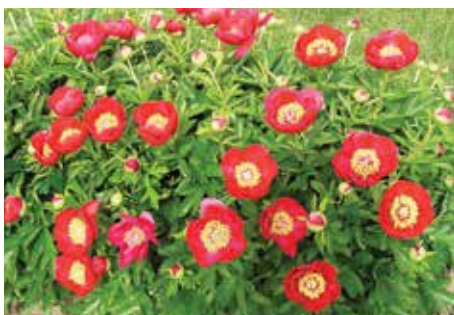
Fairy Princess $24 (Glasscock/Falk, 1955)

Salmon-pink, double, lightly fragrant, midseason, 34" tall, hybrid. A perfect symmetry of finely cupped petals with deeper color at the base. APS Gold Medal 2002.