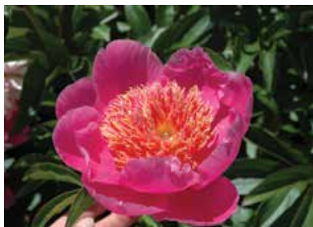
Paisley Pink $30 (McCrae/Adelman, 2019)

Pink, japanese, midseason, 36" tall, lactiflora. A creamy mix of pink-yellow stamenoids glow inside cupped jaunty pink petals.