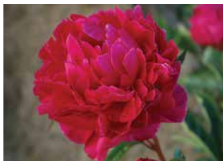
Karl Rosenfield (Rosenfield, 1908)

Orange, semi-double, midseason, 32" tall, intersectional. Tones of red, yellow and orange combine to give a copper appearance to the flower. A shorter, slow growing dark green plant.