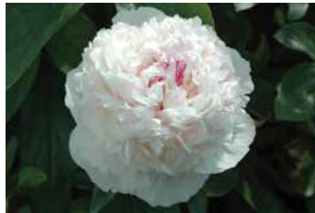
Madame de Verneville (Crousse, 1885)

Red, semi-double, early midseason, 36" tall, hybrid. A brilliant red flower that shows up clear across the garden! The large silken petals are ruffled adding fullness.