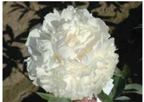
Brother Chuck $32 (R. Klehm, 1995)

Creamy white, double, lightly fragrant, midseason, 34" tall, lactiflora. Very large, luscious cream-white flower. Wonderful cut flower! APS Gold Medal 1981.