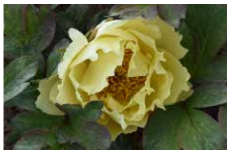
Firstlight NZ NEW $130 (Irvine/Sutherland, 2001)

White, semi-double, early, 36" tall, suffruticosa tree peony. Fluffy petals enclose contrasting gold stamens with elegance. Profuse bloomer.