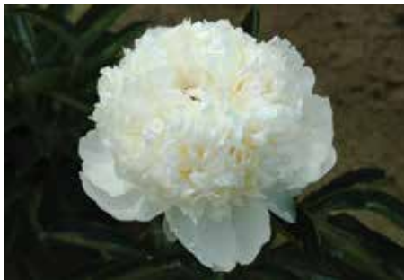
Eastern Star $18 (Bigger, 1975)

Sharp pink, semi-double, midseason, 33" tall, hybrid. Lovely plant with many stems and many flowers. Can tolerate some shade.