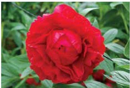
Henry Bockstoe (Bockstoe, 1955) $24 Rich cardinal red, double, fragrant, midseason, 40" tall, hybrid. Heavy petal substance with a deep red sheen. Large flowers on long stems. May need support.