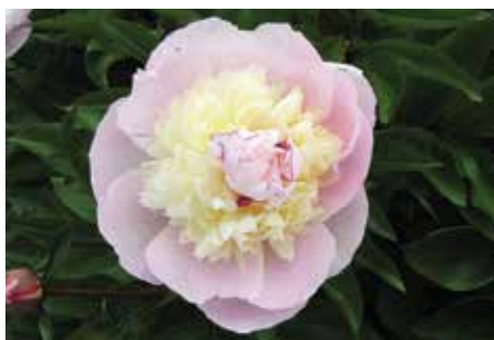
Rhapsody $30 (Auten, 1956)

Deep red, bomb, fragrant, midseason, 32" tall, hybrid. The same color as Red Charm but with a flower so tightly petaled it is almost a complete globe. One large flower per stem.