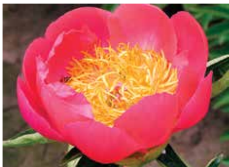
Coral 'n Gold $30 (Cousins/R. Klehm, 1981) ALM

White w/deep lavender flares, semi-double, lightly fragrant, midseason, 24" tall, intersectorial. Striking lavender flares in this white bloom.