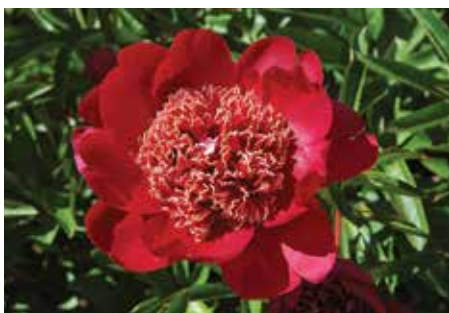
Tish $28 (Tischler, 1972)

Yellow, double, midseason, 30" tall, hybrid. Perky yellow ruffled petals with a touch of red in the center. Broad, rounded leaves on a shorter plant.