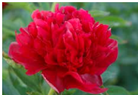
Viking Valor $32 (Pehrson/Seidl 1989)

Pink, double, lightly fragrant, late midseason, 28" tall, lactiflora. Shell pink that fades with flower maturity. Good stems and foliage.