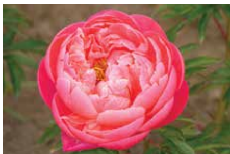
Coral Charm $26 (Wissing, 1964)

Dark red, bomb, early, 36" tall, hybrid. The dark burgundy flowers are very compact with the guard petals presenting the center pouf delectably. One of our very darkest red peonies.