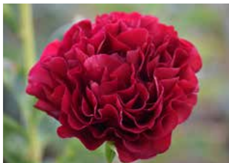
Old Faithful (Glasscock/Falk, 1964) ALM $48

Pink-yellow, anemone, lightly fragrant, midseason, 34" tall, lactiflora. The colors and textures combine to give a lacy orange cast that glows in the garden. Quite unusual.