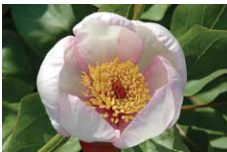
Picotee (Saunders, 1949)

Shocking pink, semi-double, early, 35" tall, hybrid. A lustrous pink semi-double that lights up the garden and your spirits early in the season! APS Gold Medal 1988.