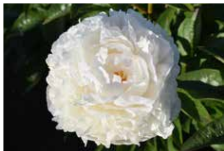
Carl G. Klehm (R. Klehm, 2017) RARE NEW $40

Creamy yellow with apricot hues in center, semi-double to double, lightly fragrant, midseason, 28" tall, intersectional. A wonderful color combination with healthy foliage.