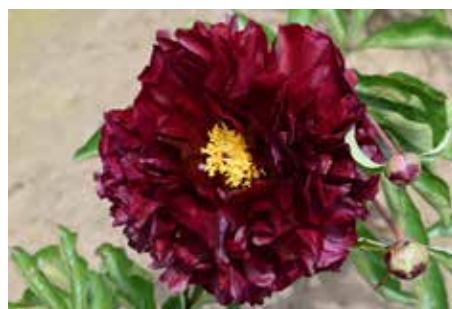
Highlight (Auten/Wild & Son, 1952) $38 Red, double, late midseason, 34" tall, lactiflora. Deep dark red coloring with strong stems. Named for being a "highlight" in the garden.