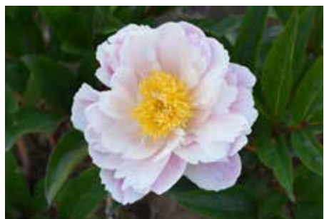
Serene Pastel NEW $36 (R. Klehm, 2000)

White, double, lightly fragrant, midseason, 34" tall, lactiflora. Medium-sized, pale pink fading to white blossoms with petals arranged in whorls. Very delicate appearance.