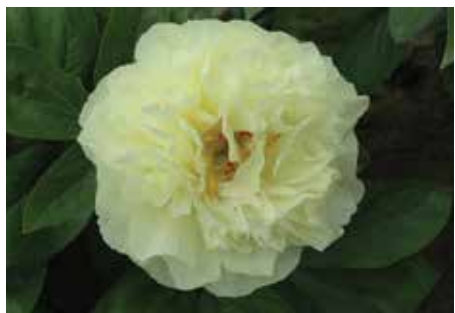
Sweet Lemonade $100 (Adelman, 2019)

Lavender pink, single, early, 12" tall, hybrid. Unique coloring of lavender to pink cupped blooms, with slender cut foliage. Mounding plant form.