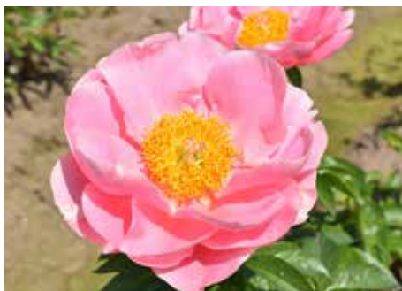
Salmon Dream (D. Reath, 1979)

Bluish-pink, single, lightly fragrant, very early, 34" tall, hybrid. A sweet flower with clear pink, textured petals framing yellow stamens. Its early color is a delight in the garden!