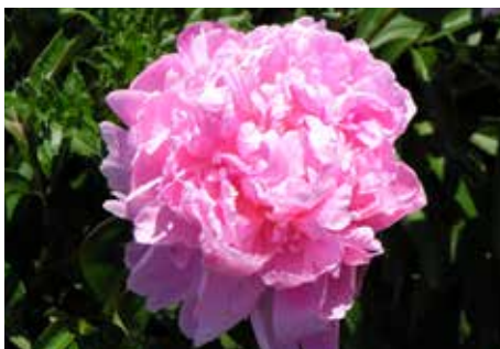
Walter Faxon $28 (Richardson, 1904)

Pink, Japanese, midseason, 34" tall, lactiflora. Medium pink petals surround creamy to yellow staminodes in this upright plant. Sidebuds extend bloom time, may need support.