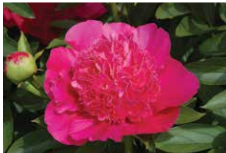
Bouquet Perfect (Tischler, 1987) $28

Red, bomb, very fragrant, early-midseason, 36" tall, lactiflora. Excellent flower on stiff stems. Good in hot climates. Love that fragrance - rare in red peonies!