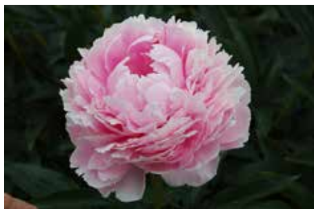
Sarah Bernhardt (Lemoine, 1906)

Magenta, single, very early, 36" tall, triple hybrid. A bold color for the early garden. A tall flower on strong stems with good foliage. Found as a single stem mutation of Roselette.