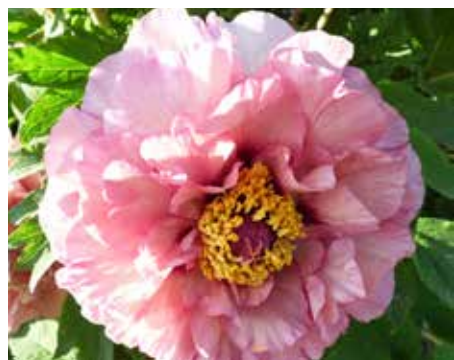
Tethys NEW $160

Red, single, early, 48" tall, lutea hybrid tree peony. An almost translucent red with dark flares in the center and yellow carpel tips surrounded by yellow stamens. The flower color fades with maturity.