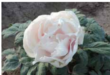
Mother Teresa (Seidl, 2007)