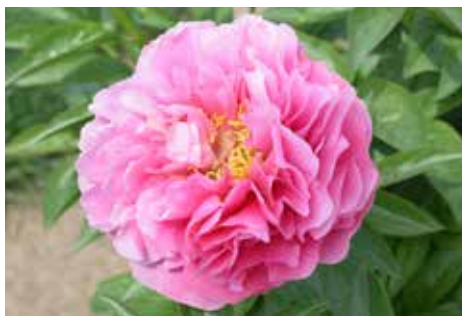
Kathy's Touch (Hollingsworth, 2009)

Cherry red, single to semi-double, fragrant, midseason, 28" tall, intersectional. Opens cherry red fading to orange then yellow. There can be three colors of flowers at the same time.