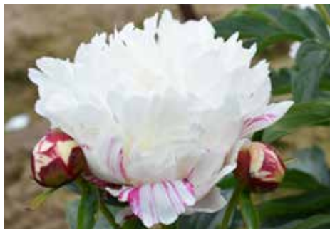
Eskimo Pie $32 (Krekler/R. Klehm, 2003)

White, double, late, 36" tall, lactiflora. Glowing white can have a touch of crimson color on the edging of the petals. Good flower form, strong stems.