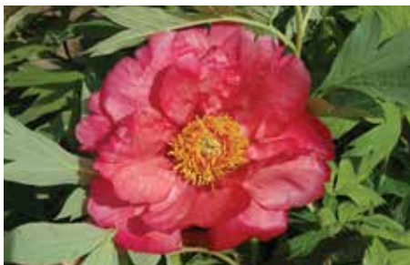
Renown $52 (Saunders, 1949)

Light pink to white with bright pink flares, semi-double, very early, 40" tall, lutea hybrid tree peony. Flowers are held upward and outward on low growing mounded plants. Pale pink to white blooms with deep pink center flares.