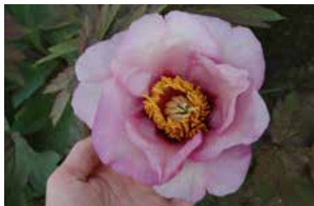
Mystery (Saunders, 1948)

Lavender, semi-double, very early, lightly fragrant, 60" tall, suffruticosa tree peony. Large lavender bloom with dark flares highlighting the center. A vigorous upright growing plant. A lovely garden specimen.