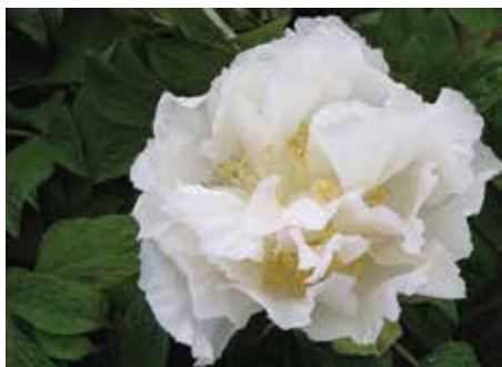
Godiasu $45 (Japan)

Pale pink, single to semi-double, to 60" tall, suffruticosa tree peony. Dark purple flares in the center draw you to this delicate flower that fades from light pink to white.