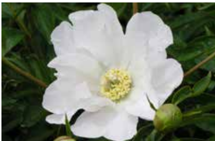
White Innocence $30 (Saunders, 1947)

Pink, double, fragrant, late, 39" tall, lactiflora. Lively pink outer petals with a fluffy mounded ivory-pink center. Named for its size and fragrant too!