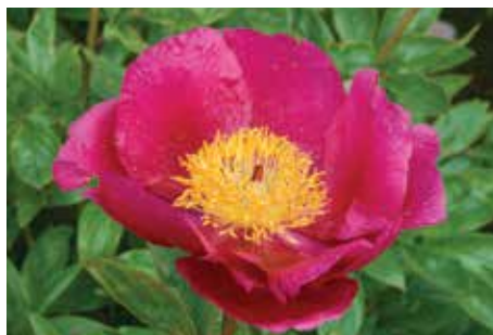
Roselette's Baby (Adelman, 2019)

Pink, semi-double, midseason, 32" tall, hybrid. A cupped, warm salmon-pink delight with dark green glossy foliage. 2008 APS Gold Medal.