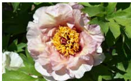
Theresa Anne $125

Yellow, single, very early, 40" tall, lutea hybrid tree peony. An apricot/yellow bloom with a delicate look of crumpled silk. Three flowers per stem make a long bloom period.