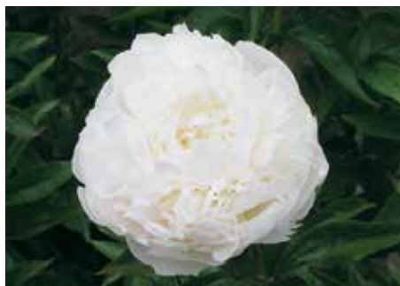
Henry Sass (Sass/Interstate Nurseries, 1949) $22 White, double, lightly fragrant, midseason, 34" tall, lactiflora. A magnificent large, pure white double. Strong stems and dark foliage.