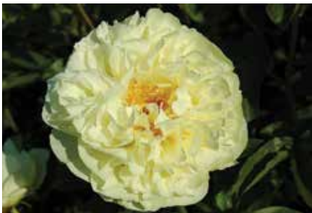
Lemon Chiffon $60 (D. Reath, 1981)

Pink, japanese, midseason, 38" tall, lactiflora. Deep pink guard petals surround a spiky center of lighter petaloids etched in peach. Many side-buds for a longer bloom period.