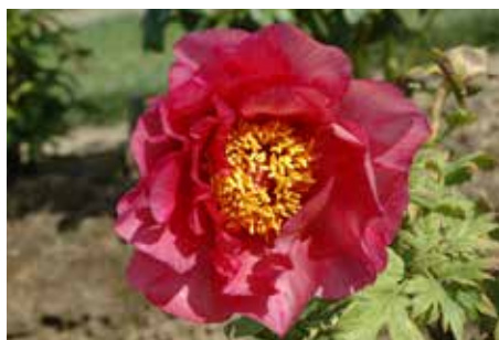
Door County Sunset $80 (Seidl, 1996)

Pink, single, fragrant, early, 36" tall, lutea hybrid tree peony. Starts out a coral pink color with a cream/yellow overlay that fades as the flower matures. Strong, reliable blooms on a vigorous plant.