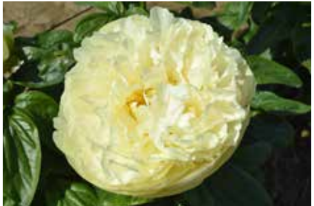
Yellow Bird $300 (Johnson/Adelman, 2019)

White, single, late midseason, 48" tall, hybrid. Very unusual single flowers with a center similar to an empress magnolia. Many small flowers on tall stems. Very unique.