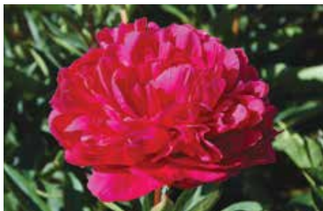
Kansas (Bigger, 1940)

Pink, semi-double, early, 32" tall, hybrid. Semi-double with tendency to have more doubling some years. Medium bright pink, no support needed. One of our earliest medium pink flowers to bloom.