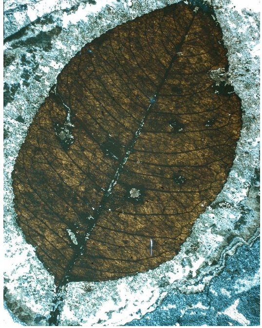
Fossil leaf from Horsefly