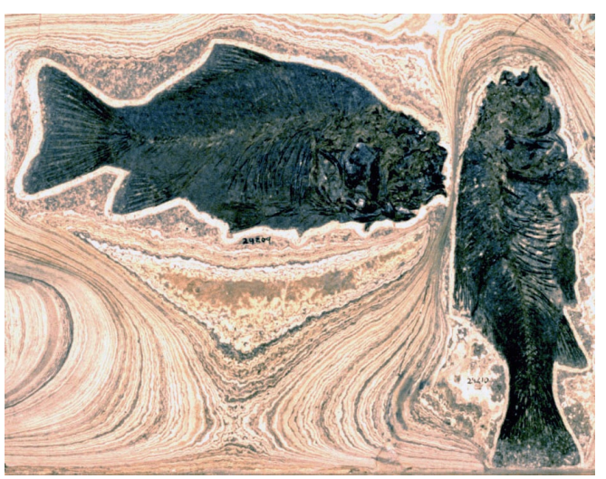
Fossil fish from Horsefly