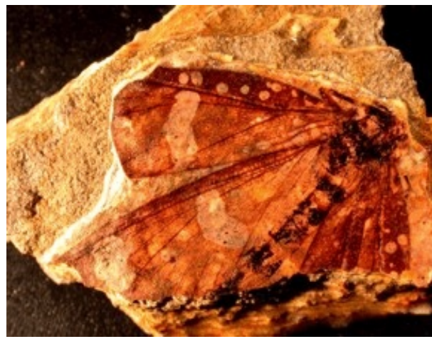
Scorpionfly from Horsefly

Unlike many other fossil sites of Eocene age, which typically show evidence of tropical-like environmental conditions, Horsefly records the presence of a temperate flora, and evidence of seasonally cooler temperatures. This difference is likely due to the combined effects of its moderate elevation and higher latitude.