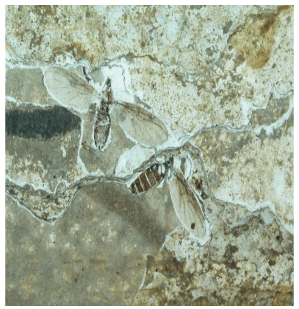
March flies from Horsefly