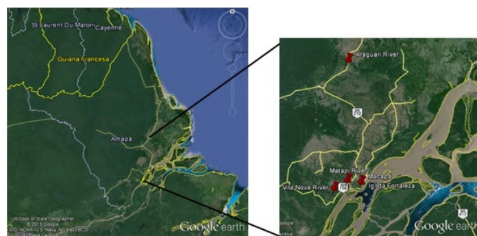
Figure 1. Location of sampling points used. / Figura 1. Localização dos pontos de amostragem utilizados.

sampled upstream of the ferry that crosses the river, between the coordinates 00°04,8'S 051°18,32'W and 00°04,49'S 051°17,67'W.