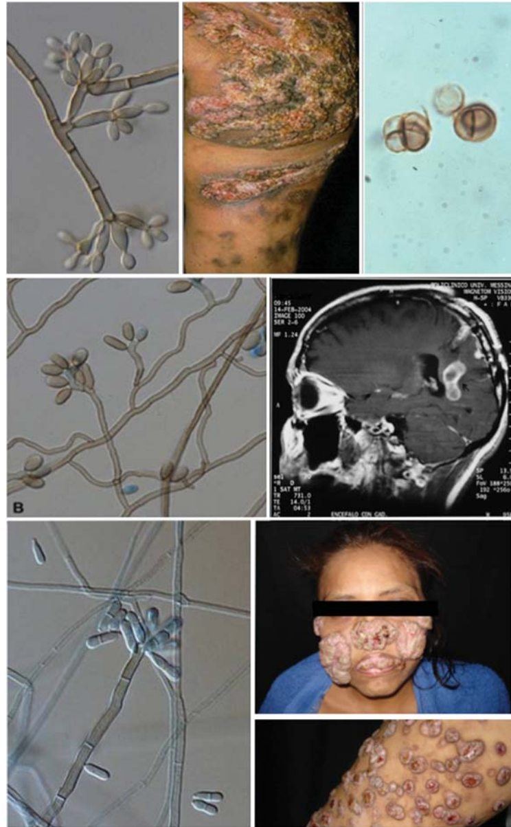
Figure 3. Chaetothyrialean agents of deep infections. Upper row: Fonsecaea pedrosoi causing chromoblastomycosis with muriform cells; middle row: Ramichloridium mackenziei , agent of cerebral phaeomycosis (case shown caused by Cladophialophora bantiana ); bottom row: disseminated infection caused by Veronea botryosa .

grow very slowly with olivaceous black colonies and produce thin-walled, sickle-shaped conidia with one or several transverse septa. Conidia are produced in packages from phialide openings on spherical conidiogenous cells or directly from hyphae.