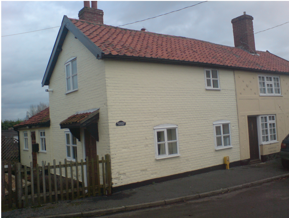
Bloomfield's birthplace, Honington

Bloomfield was born at Honington, south-east of Thetford in Suffolk, on December 3rd 1766.