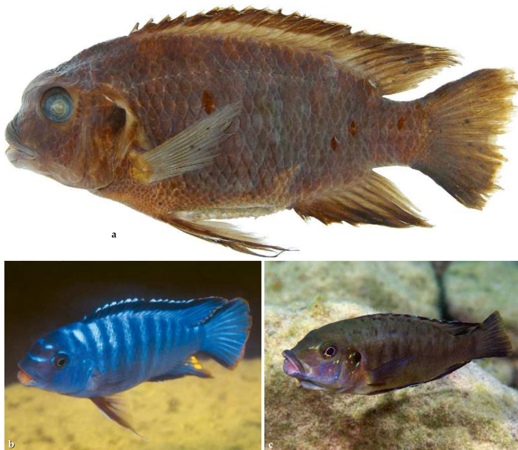
Fig. 5. Petrotilapia mumboensis , Malaŵi: Lake Malaŵi: Mumbo Island; a, PSU 4765, holotype, 106.1 mm SL, adult male; b, adult male; c, adult female (mouthbrooding).

data as for holotype. – PSU 4763, 9, 78.9–105.5 mm SL; Malaŵi: Mumbo Island, 13°59.5' S 34°45.4' E; J. R. Stauffer and S.M. Grant, 15 Apr 2003. – PSU 4748, 1, 127.2 mm SL; Malaŵi: Thumbi West Island, 14°0.9' S 34°48.3' E; A. F. Konings and J. R. Stauffer, 7 Feb 2003. – PSU 4747, 16, 80.2–120.6 mm SL; Malaŵi: Thumbi West Island; J.R. Stauffer, 28 Jan 2000. – PSU 4746, 4, 103.4–127.2 mm SL; Malaŵi: Thumbi West Island, 14°0.8' S 34°48.3' E; A. F. Konings and J. R. Stauffer, 7 Feb 2003.