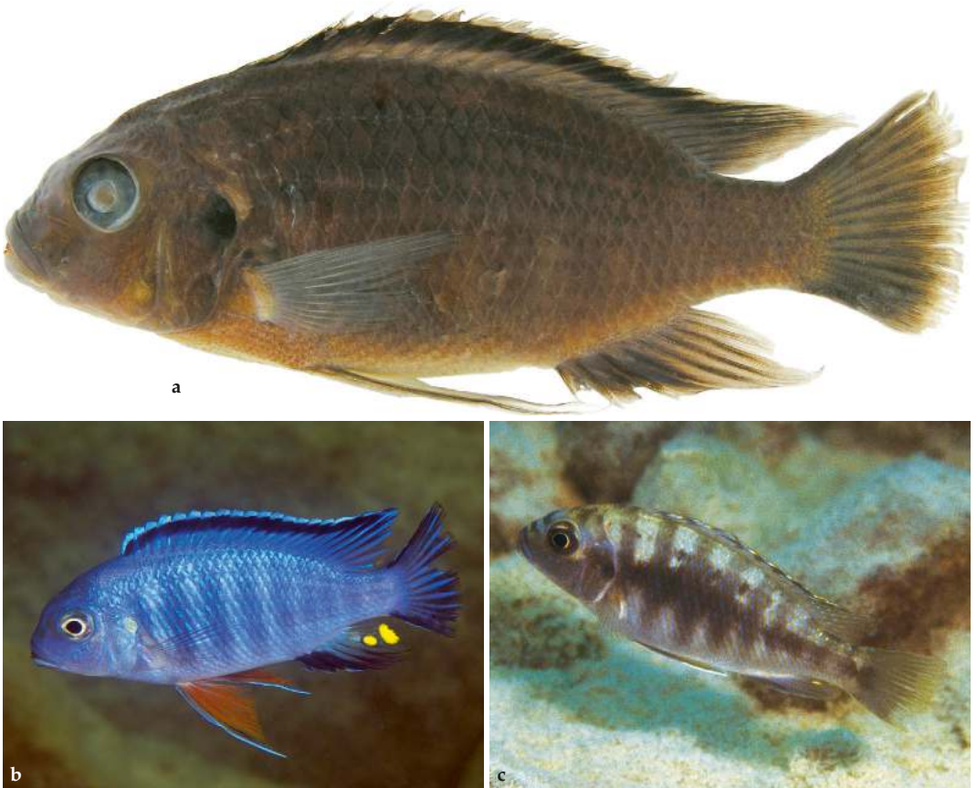
Fig. 6. Petrotilapia pyrosceles , Malaŵi: Lake Malaŵi: Chizumulu Island; a , PSU 4753, holotype, 107.2 mm SL, adult male; Mkanila Bay; b , adult male; Same Bay; c , adult female; Mkanila Bay.

from those of P. genalutea , P. nigra , P. chrysos , and P. microgalana by the brown to gray ground color on the flank which is beige or yellow in the other species and are distinguished from females of P. mumboensis which lack any horizontal elements of the flank's pigmentation pattern.