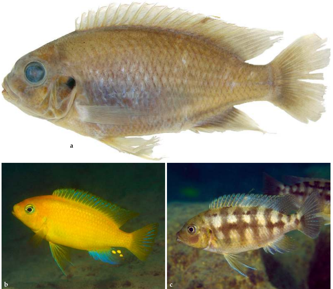
Fig. 2. Petrotilapia xanthos , Malaŵi: Lake Malaŵi: Gallireya Reef; a , PSU 4757, holotype, 130.4 mm SL, adult male; b , adult male; c , adult female.

Etymology. The name xanthos , from the Greek, meaning yellow referring to the yellow breeding color of males. A noun in apposition.