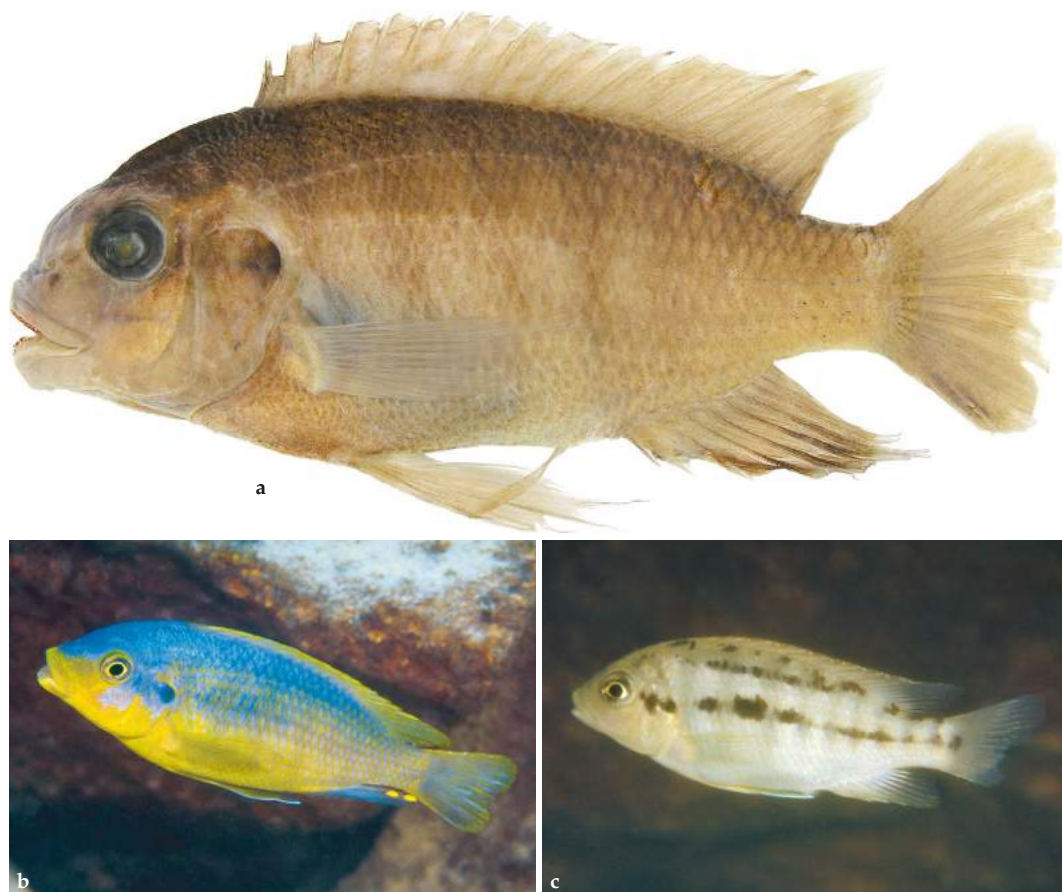
Fig. 3. Petrotilapia flaviventris , Malaŵi: Lake Malaŵi: Chizumulu Island; a, PSU 4760, holotype, 110.9 mm SL, adult male; Same Bay; b, adult male; Mkanila Bay; c, adult female; Mkanila Bay.

guishes them from those of P. tridentiger , which are brown and from P. chrysos and P. microgalana , which are golden yellow. Females of P. flaviventris are further distinguished from those of P. xanthos , which are light brown.