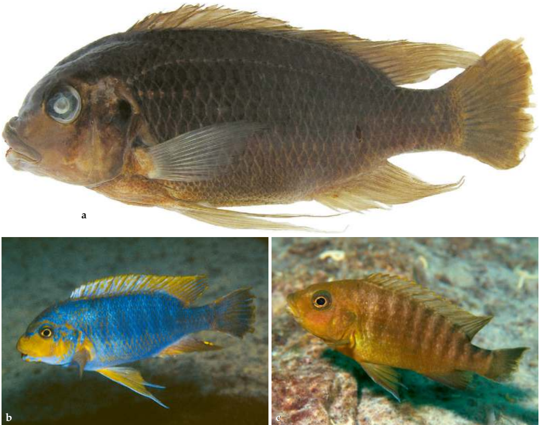
Fig. 4. Petrotilapia palingnathos , Malaŵi: Lake Malaŵi: Chizumulu Island; a , PSU 4767, holotype, 118.0 mm SL, adult male; Same Bay; b , adult male; Mkanila Bay; c , adult female; Same Bay.

low to orange. Dorsal fin without black submarginal band; spines and rays brown with orange lappets and clear membranes. Pelvic fin brown with blue leading edge and clear membranes. Pectoral fin with brown rays and clear membranes.