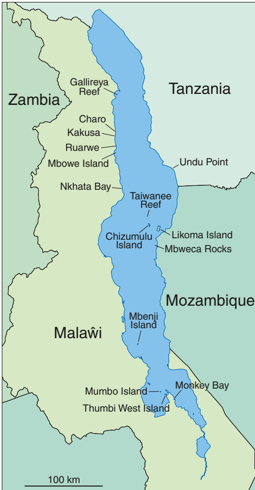
Fig. 1. Map of Lake Malaŵi showing distribution of species discussed in text.

modified the generic diagnosis to include cichlids with predominantly tricuspid teeth in the major dentigerous area because there is usually a single or double lateral series of stout unicuspid teeth on both jaws posterior to that area.