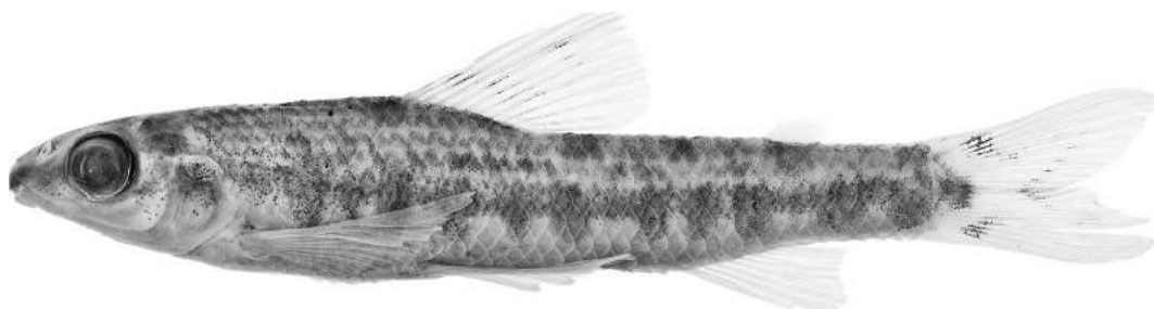
Fig. 1. Nannocharax dageti , MRAC P-88846, holotype, 34.8 mm SL; Democratic Republic of the Congo: Kando.