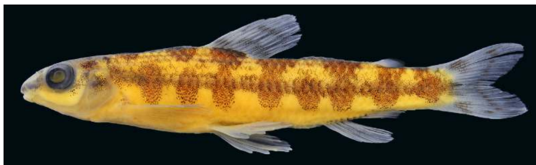
Fig. 2. Nannocharax dageti , CUMV 91303, 34.4 mm SL; Zambia: Northern Province: Samfa rapids at pontoon on Chambeshi River.

1972.8.4.18–32, 11 of 15, 21.8–39.1 mm SL (10 measured, 27.1–39.1 mm SL); Zambia; G. Bell-Cross. – CUMV 91303, 5, 30.1–34.4 mm SL, Zambia: Northern Province: Chambeshi River drainage, Samfa Rapids at pontoon on Chambeshi River; 10°51'07.5"S 31°10'02.2"E; R. Bills, Chilala & J. P. Friel, 11 Oct 2005. – MRAC P-96083.1136–96083.1139, 4, 26.8–29.9 mm SL; Zambia: Chambeshi River system, Lukupa River, approximately 28 km on road from Kasam to Luwingu; 10°10'49.9"S 30°57'45.4"E; L. de Vos, 20 Oct 1995. – MRAC P-142078–142081, 4, 35.5–44.2 mm SL; Zambia: Solwezi River, Kafue River system; 12°12'S 26°24'E; G. Bell-Cross, 8 Mar 1963. – MRAC P-144818–144821, 4, 32.2–41.9 mm SL; Democratic Republic of the Congo: Katanga: Kimilolo River, environs of Lubumbashi (formerly Élisabethville); M. Lips, Sep 1962. – MRAC P-144872–144873, 2, 26.6–27.9 mm SL; Democratic Republic of the Congo: Katanga: environs of Lubumbashi (formerly Élisabethville); M. Lips, 1963. – ZSM 41949, 3, 26.0–29.2 mm SL; Democratic Republic of Congo: Lualaba Province: Kasai River below and above Saipako Falls, 975 m asl, approximately 15 km by air NNW of Dilolo at