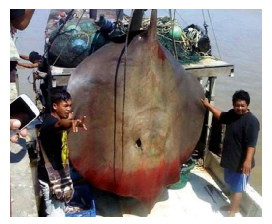
Fig. 2. Urogymnus cf. polylepis caught by local fishermen on 25 August 2013 in Beluran, Sandakan, Sabah, Malaysian Borneo.

Hilir Selatan, Kalimantan Tengah, Indonesia) in the southern part of the island (Table 1). Records of individual weights ranged from 82 to 400 kg. Unfortunately, information on total length and disc width are very limited, as in most instances measurements were not taken by fishermen, and fishermen frequently remove the tails of these rays to avoid the caudal sting. Urogymnus cf. polylepis reaches at least 2 m disc width and 5 m in total length, and can possibly grow larger according to reports from the Mekong and Chao Phraya Rivers of individuals weighing 500–600 kg (Monkolprasit & Roberts, 1990; Last et al., 2016a).