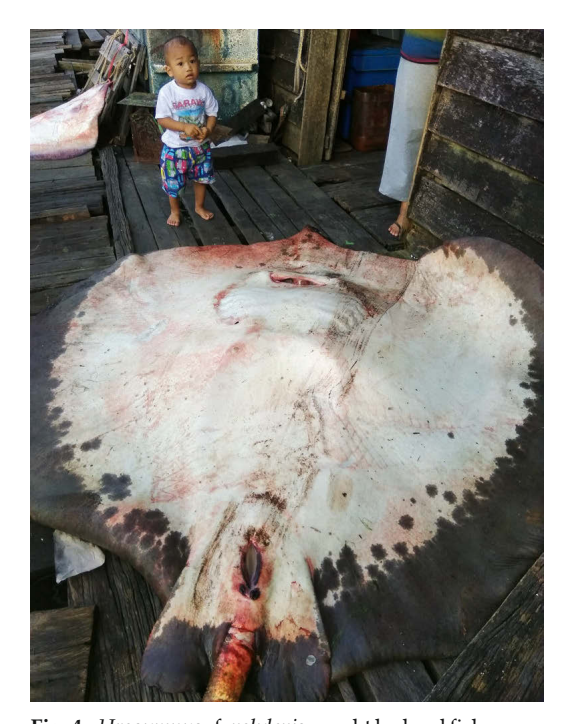
Fig. 4. Urogymnus cf. polylepis caught by local fishermen on 12 April 2018 in Tarakan, Pulau Tarakan, Kalimantan Utara, Indonesia.

Anecdotal records of Urogymnus cf. polylepis from the Kapuas River in West Kalimantan (Vidthayanon et al., 2016) were not confirmed and therefore not considered by Last et al. (2016a)