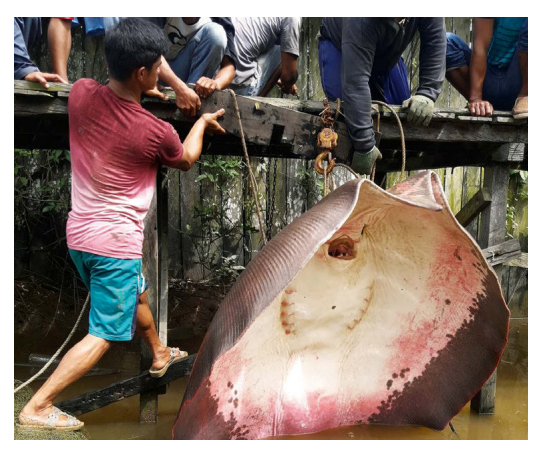
Fig. 3. Urogymnus cf. polylepis caught by local fishermen on 7 January 2018 in Handil, Kutai Kartanegara, Kalimantan Timur, Indonesia.

A record of Urogymnus cf. polylepis from Danau, Kampung Penapar, Telisai coastal village, Tutong district, on 20 September 2011 represents the country's first confirmed record for Brunei Darussalam.