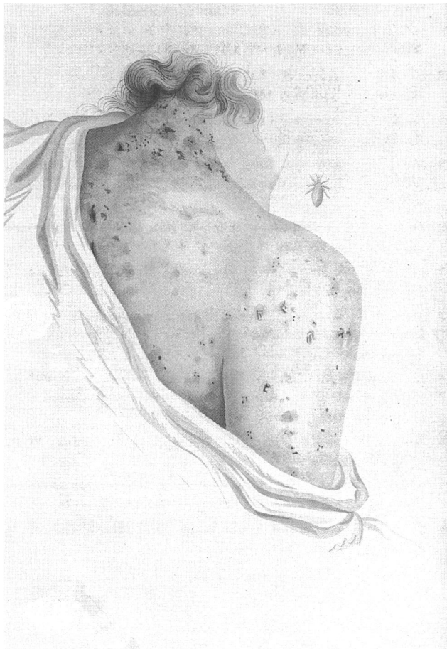
Figure 2 The only known illustration of a patient with phthiriasis, from Baron Alibert's Clinique de l'Hôpital de Saint-Louis

In 1940, Professor A C Oudemans published a thorough study of phthiriasis and its history 1 . His studies of a species of mites known as Harpyrynchus made him inclined to believe that the lousy disease had really existed and that it was caused by a subspecies called H. tabescentium . Although no modern case of Harpyrynchus infestation on man has been recorded, there is a good deal of evidence for this hypothesis. Modern descriptions of Harpyrynchus infestation of birds much resemble the classical reports of phthiriasis. These insects are the only mites capable of burrowing under the entire skin, where they live in large clusters of individuals of varying age and size 31,32 . Harpyrynchus usually infest birds, and through excessive growth of the mite-tumour and development of hyperkeratosis they may even kill their wretched victims. When the insect-tumour, which is the size of a hazel-nut, is opened, thousands of mites stream out. Microscopic investigation shows that the