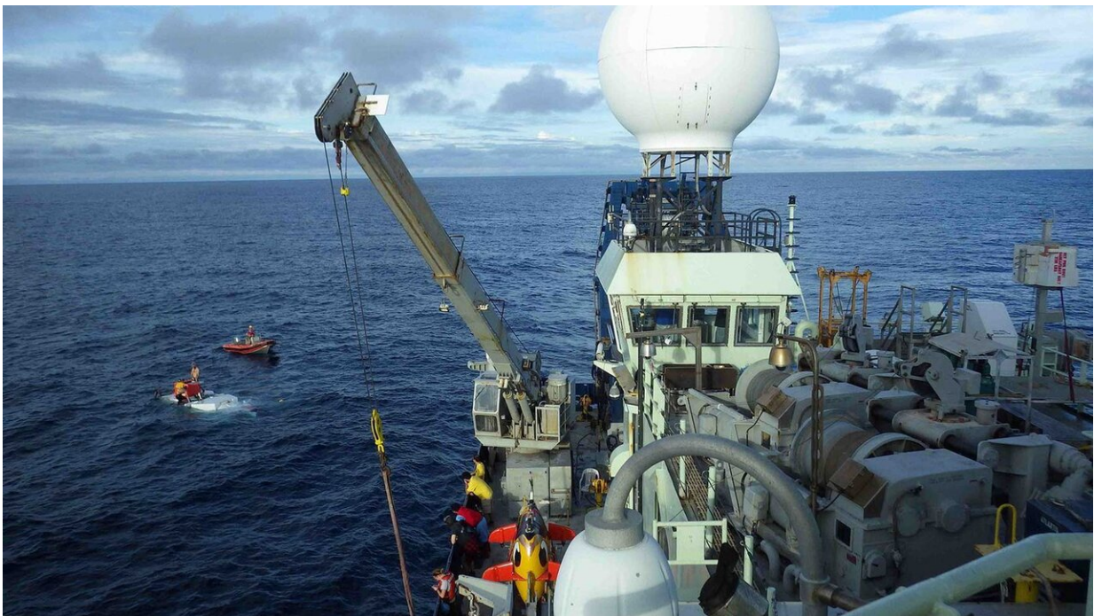
Surface recovery of the human-occupied submersible Alvin, with the recovery team on the small boat in view. Taken from atop the R/V Atlantis.

Once the worms were brought topside, the scientists analyzed their tissues, cataloging the carbon isotopes that they had consumed. Carbon exists in two stable isotopic forms—different "flavors" of carbon, so to speak. Around 99 percent of all carbon is carbon-12, which has six neutrons and six protons in each atomic nucleus, and about 1 percent is carbon-13 (six protons and seven neutrons). Carbon-14, a radioactive isotope, exists in trace amounts.