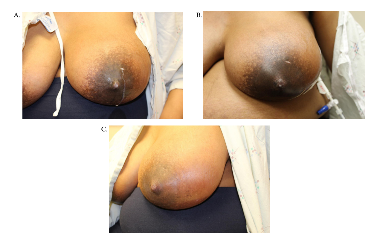
Fig. 1. 27-year-old woman with milk fistula of the left breast. A. Milk fistula located two centimeters from the nipple at 12 o'clock, diagnosed six days after an incision and drainage procedure for a large retroareolar abscess at 3 weeks postpartum. B. A diverting drain was placed by Interventional Radiology remote from the nipple to facilitate milk fistula closure. C. Healed milk fistula and lateral drain site.

drainage from the incision while pumping. She was instructed to avoid pumping, as the flanges potentiated incision trauma. She also was told to keep the breast well-drained via the nipple with hand expression. She applied nipple balm and hydrogel dressings to the incision to promote moist wound healing. The defect became progressively smaller over the next week, but nevertheless remained patent.