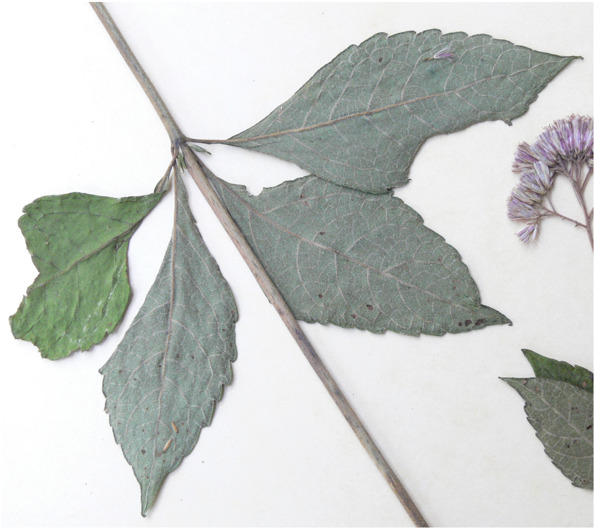
Figure 3. Leaves of Eutrochium purpureum var. carolinianum showing densely soft-lanulose abaxial surface and veins and thickish, rugose texture.