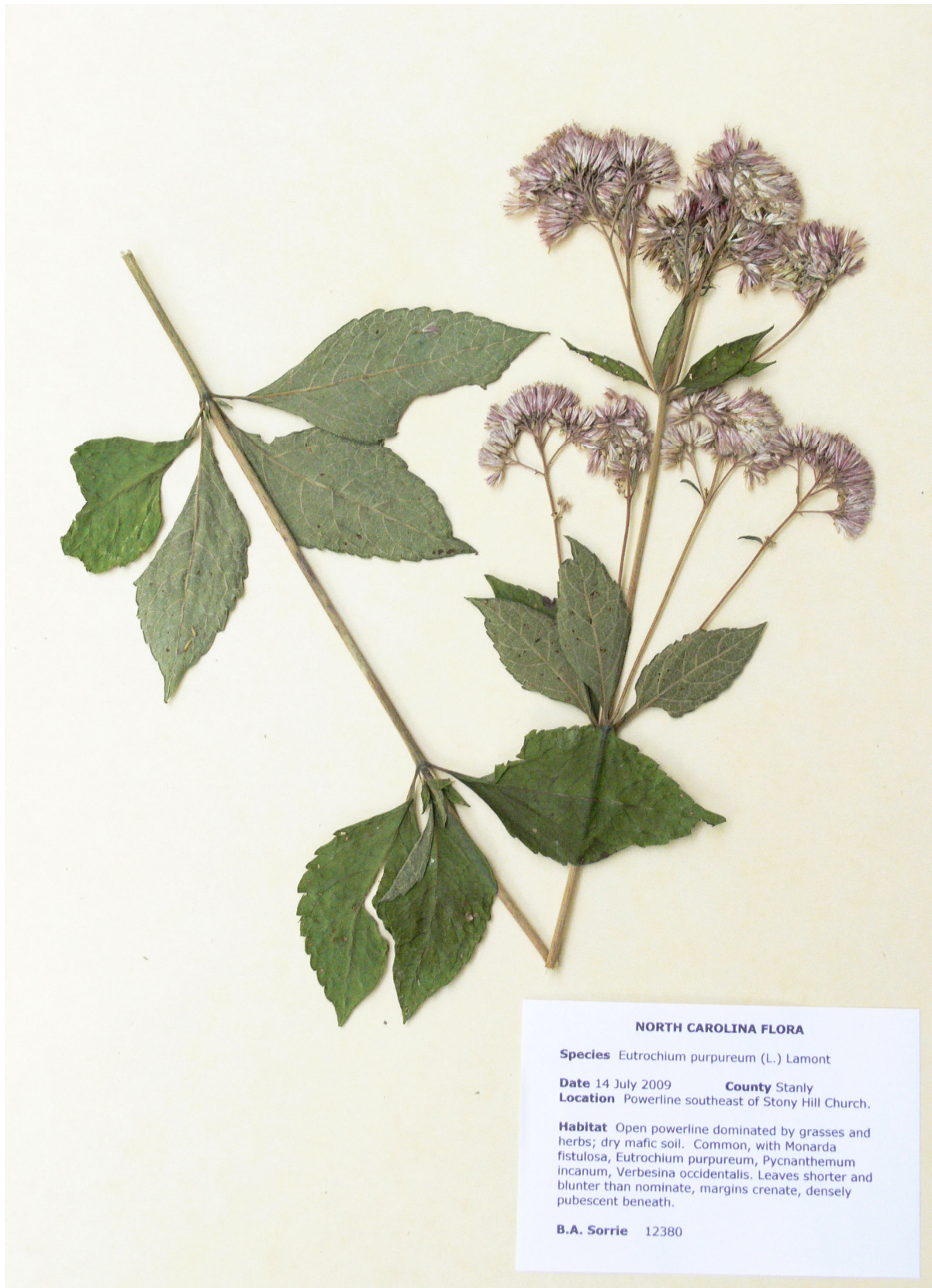
Figure 2. Holotype of Eutrochium purpureum var. carolinianum .