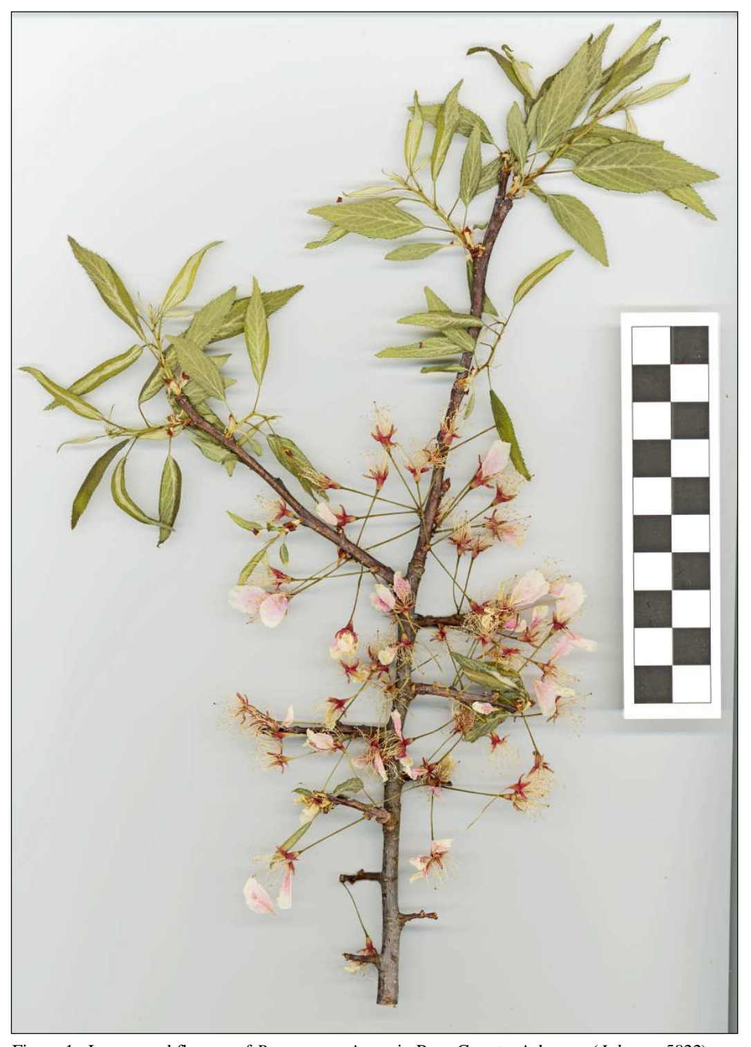
Figure 1. Leaves and flowers of Prunus americana in Pope County, Arkansas ( Johnson 5822 ).

Voucher specimen. USA. Arkansas. Pope Co.: Pine Ridge Gardens Nursery, owned by Mary Ann King, NW of London, 1.3 km N of the intersection of Sycamore Road with Will Baker Road, 425m NE of Sycamore Road; lat. 35.36851° N, long. -93.29533° W; 171 m elev.; T8N, R22W, NW 1/4 of NW 1/4 of Sect. 12 (essentially on line with Sect. 1); 8 April 2010, G.P. Johnson 5822 (APCR).