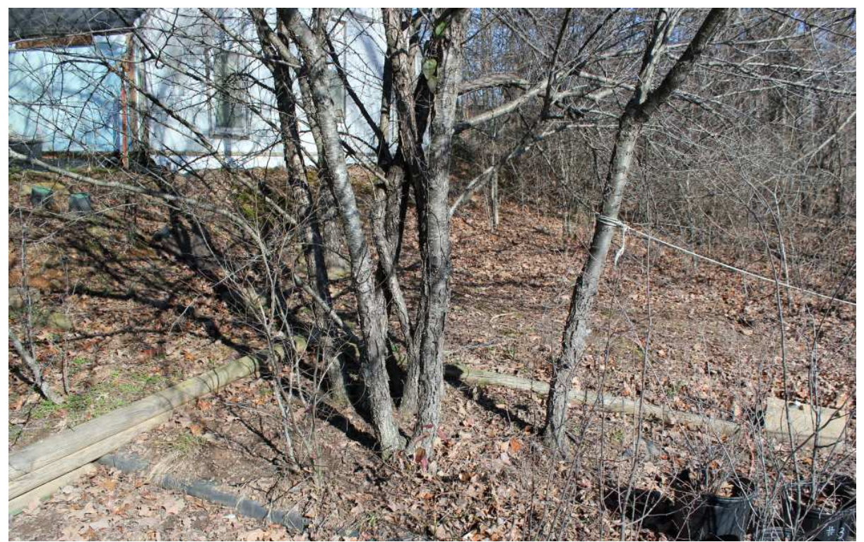
Figure 3. Clonal growth of Prunus americana in Pope County, Arkansas ( Johnson 5822 ).

Prunus americana (Figs. 1, 2, and 3) occurs as a colony of small trees, each approximately 4 meters tall. Although the plants now grow in a commercial native plant nursery, there is no evidence that they were planted, and the plants were in existence when the property was purchased in 1975. At that time, the plants were growing at the edge of an oak-hickory-pine woodland. Although the trees flower and fruit profusely, there are no other colonies in the immediate area.