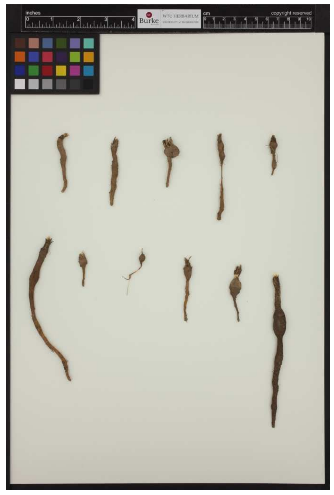
Figure 4. Lomatium knokei roots depicting the range of variation of morphology typical for the species. Note the tuberous swelling immediately beneath the root crown on the majority of the specimens.