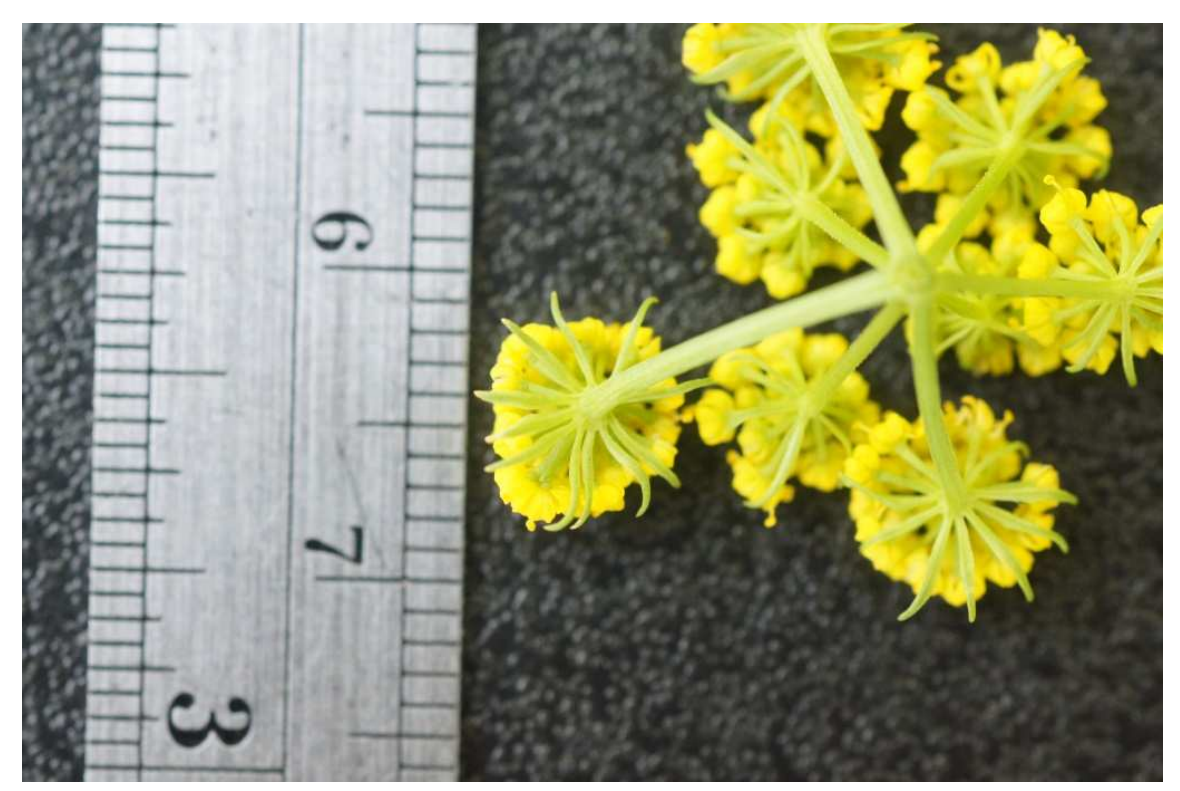
Figure 5. Lomatium knokei inflorescence showing well-developed involucel bracts.