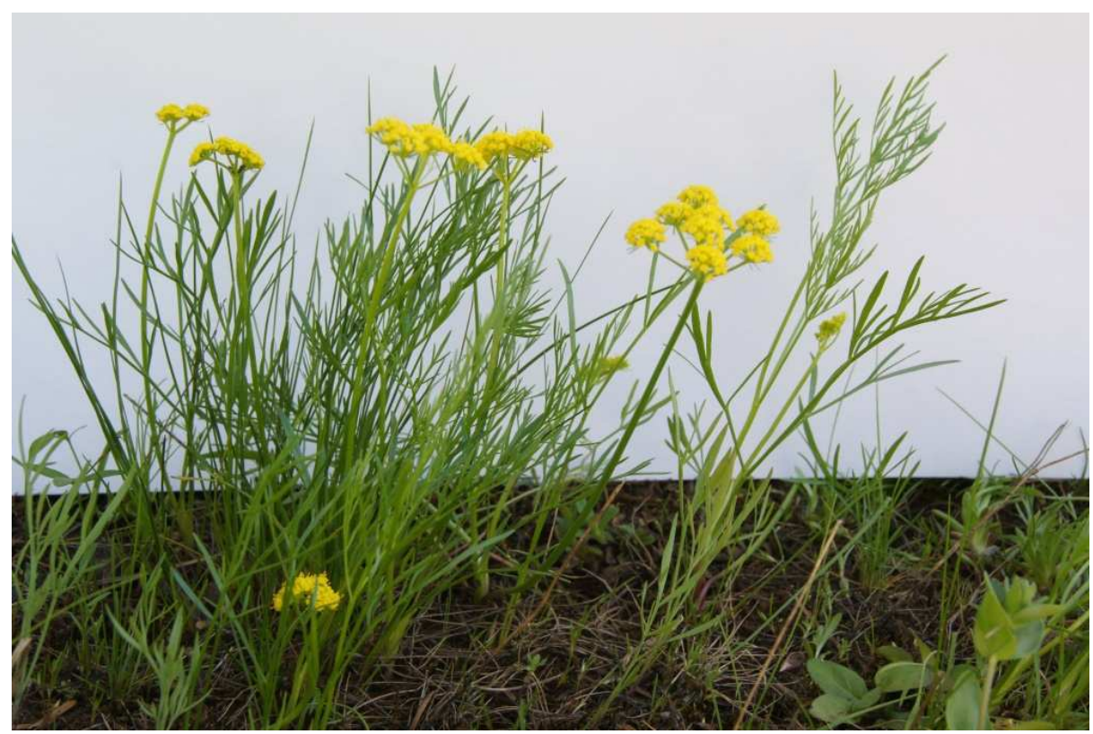
Figure 7. Lomatium knokei mature plants in situ at anthesis. Plants are approximately 20 to 25 cm in height in this view.