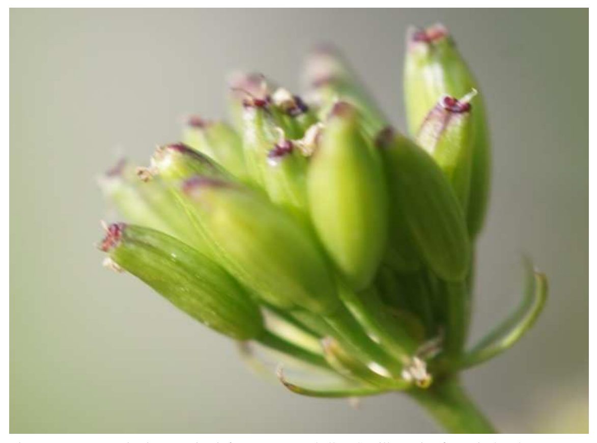
Figure 6. Lomatium knokei maturing infructescence umbellet. See illustration for typical scale.