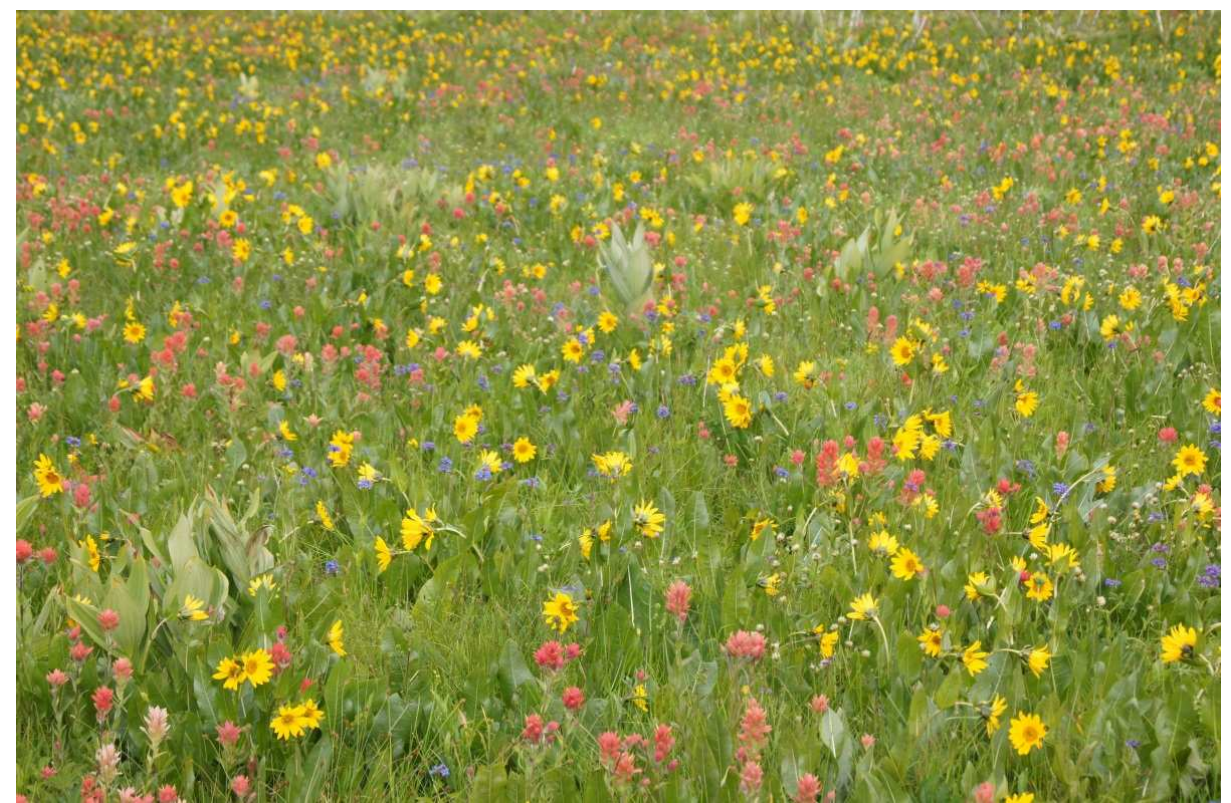
Figure 8. Lomatium knokei habitat at the type locality.