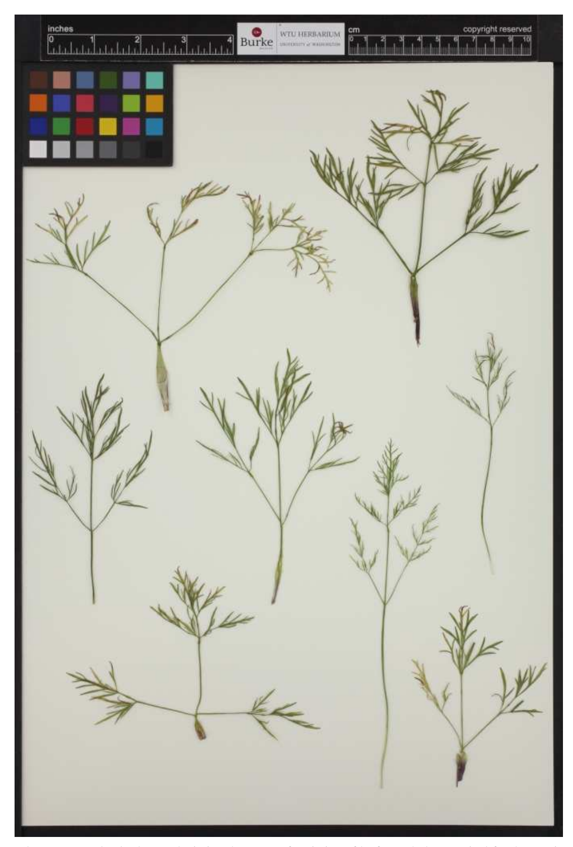
Figure 3. Lomatium knokei leaves depicting the range of variation of leaf morphology typical for the species. Those leaves shown with broad petiole bases are primary while those lacking this feature are axial leaves that arise from inside the broad petiole bases of the primary leaves.