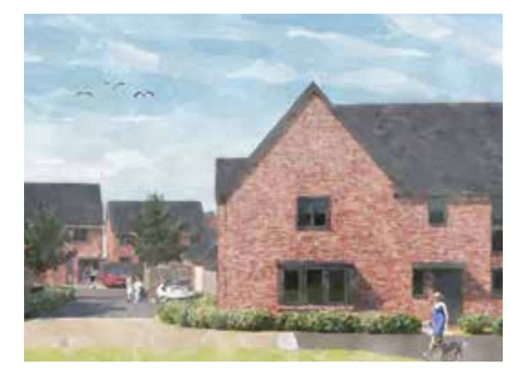
Illustrative Image - Typical family homes overlooking public realm