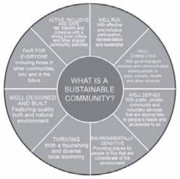
Egan sustainable communities wheel