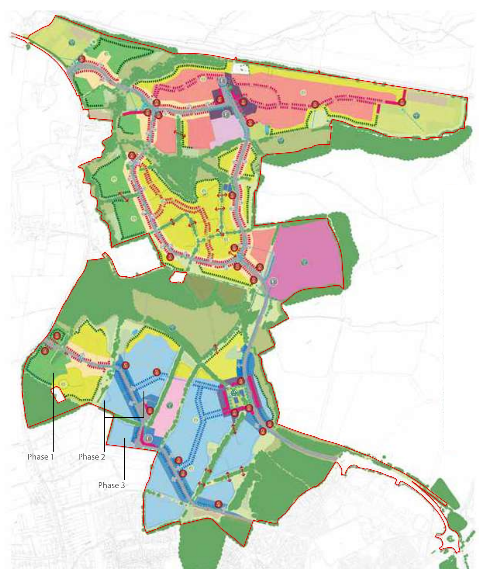
North Whiteley Design Code Regulation Plan