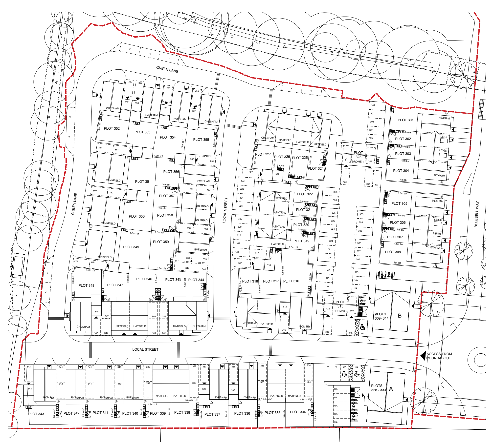
Reserved Matters Approved Site Plan

Refer to Section 4 of this document for further details of the design development.