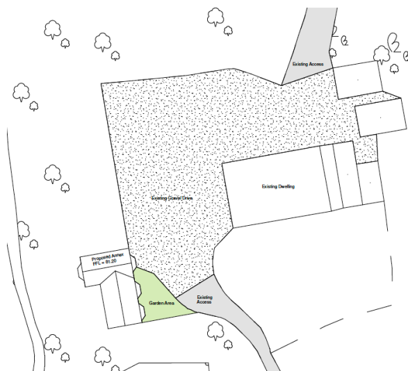
Figure 7 – Proposed Site Plan showing location of proposed annexe to the west of the principal elevation of Trevelloe House

The proposal would be of high quality architectural design minimising some of the design features of the host dwelling, including natural slate roof and slate hanging as with the adjacent dwelling, conservation style rooflights and Cornish stone.