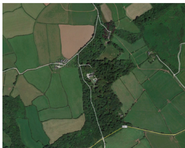
Figure 1 – Extract of Location Plan