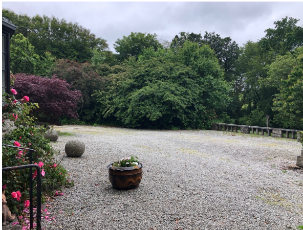
Figure 5 – Location of proposed annexe to the west of Trevelloe House