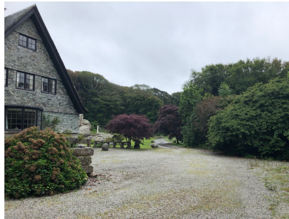
Figure 6 – West elevation of Trevelloe House and driveway

Trevelloe House was designed by architect Arnold Mitchell FRIBA and built in 1911 for the Bolitho Estate. It is characteristic of Mitchell's style, with tall gables, slate hanging and long ranges of mullioned windows. The house sits within an extensive garden with long sweeping drive from the south, that leads to a large gravel driveway and turning area adjacent to the property. A detached garage and store is located to the side (north) of the property and a small summerhouse is located within the garden.