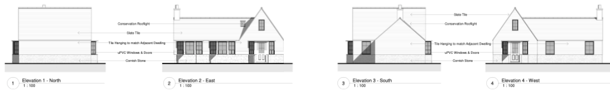
Figure 8 – Extract of proposed elevations