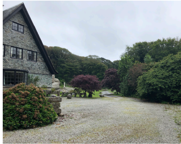
Figure 4 – West (front) elevation of Trevelloe House