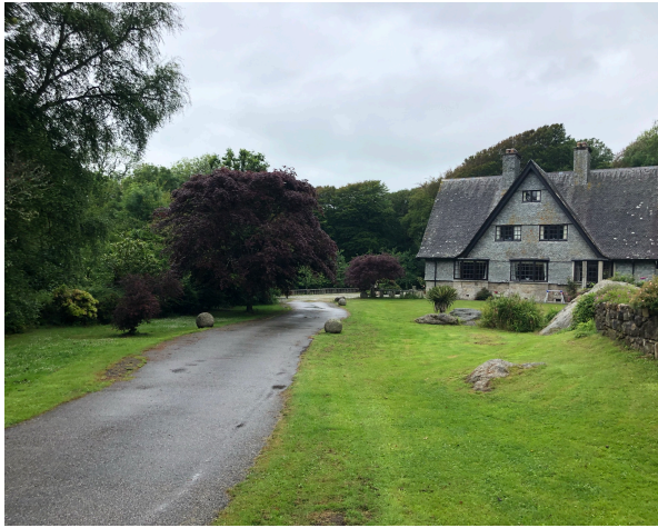
Figure 3 – South elevation of Trevelloe House from drive