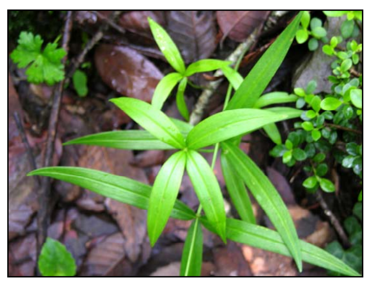
Fig. 1. P. verticillatum: Leaf pattern

[GAUR, 1999], 'meda' in Ayurveda, Dhara, Manichhidra and Svalpaparni in Sanskrit (Fig. 2). It is also a tall erect, perennial herb, 60-120 cm high with whorled (3-6) sessile, linear leaves having tendril like tips. Flowers white, green purplish or pink on short stocks and the fruit is round blue-black berry found in the temperate Himalayas at the altitudes of 1200-4200 m. Rhizomes are thick and fleshy. In Garhwal, NAITHANI (1984) reported it from Gulabkoti, Sitapur and Sutul while Gaur (1999) from Khirsu.