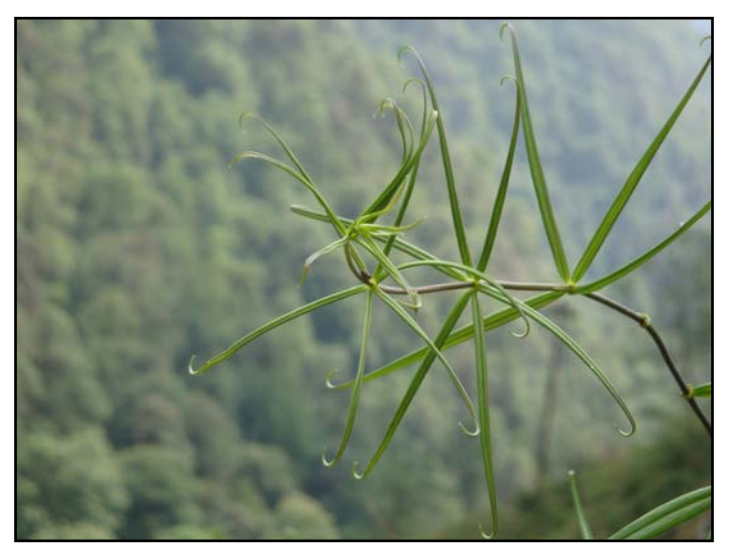
Fig. 2. P. cirrhifolium: Leaf pattern