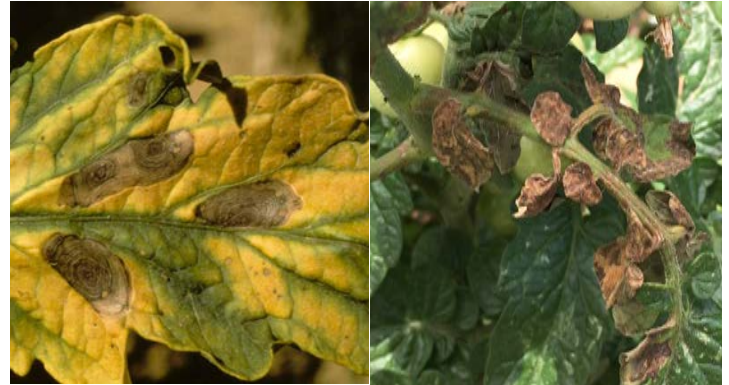
Figure 2: Middle (left) and late (right) symptoms of early blight.