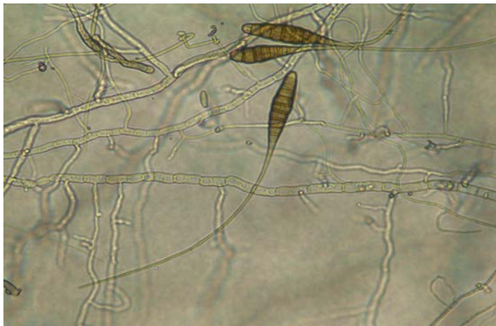
Figure 5: Characteristic, long beaked, spores of Alternaria solani , the causal agent of early blight.

Phoma rot symptoms – Phoma rot may also occur on the leaves, stems and fruit. On leaves, irregularly shaped, sunken lesions develop on both the upper and lower leaf surfaces (Fig.6). As the lesions expand, they become ‘zonate’ (an appearance of concentric rings) (Fig. 7).