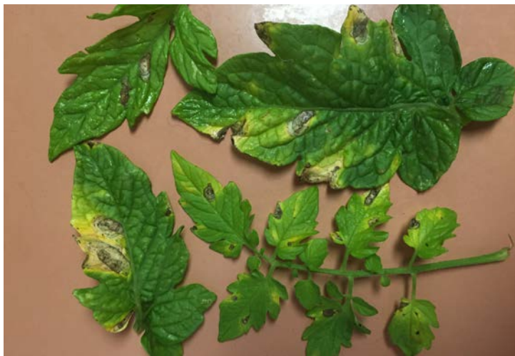
Figure 6: Initial leaf spots caused by Phoma rot (Photo: N. Goldberg, NMSU-PDC).

Phoma rot symptoms – Phoma rot may also occur on the leaves, stems and fruit. On leaves, irregularly shaped, sunken lesions develop on both the upper and lower leaf surfaces (Fig.6). As the lesions expand, they become ‘zonate’ (an appearance of concentric rings) (Fig. 7).