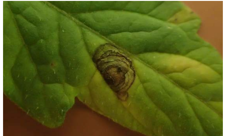
Figure 7: Zonate lesion on a tomato leaf infected with Phoma rot.

The tissue around the lesions may become yellow or necrotic. Over time, lesions may grow together resulting in leaf blight (Fig. 8) and premature defoliation. Pycnidia embedded in the leaf lesions are visible with a dissecting microscope (Fig. 9A) and may be visible with a good hand lens. These round to egg shaped fruiting bodies contain numerous single celled spores (Fig. 9B), which serve as inoculum for new infections.