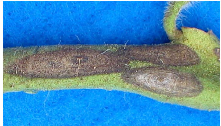
Figure 3: Stem lesions caused by early blight.