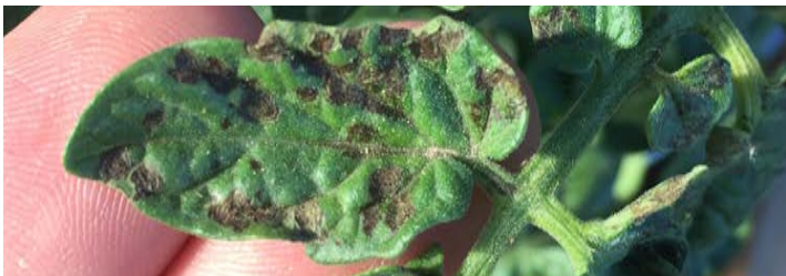
Figure 1: Initial leaf spots caused by early blight (Photo: J. French, NMSU - PDC).

Early blight symptoms – Early blight may occur on the foliage, stems and fruit. On leaves, the disease begins as small, brownish black spots (Fig. 1). The tissue around the spot may turn yellow and when spots are abundant on the leaf, the whole leaf may turn yellow. Spots rapidly increase in size. As they enlarge, concentric rings may become visible in the dark brown tissue. As the disease advances, leaves may become blighted and necrotic (Fig. 2) and the plant may drop leaves prematurely. On stems, lesions are circular to elongate in shape with pronounced concentric rings and light colored centers (Fig. 3). Stem lesions, especially when they occur on seedlings or small plants, may girdle the plant resulting in plant death. This phase of the disease is often referred to as collar rot. Fruit is usually infected through the calyx, also known as the stem attachment. Fruit lesions may become quite large, sometimes involving the whole fruit, and usually have concentric rings (Fig. 4). The diseased areas become leathery and may be covered in a mass of characteristic black spores (Fig. 5).