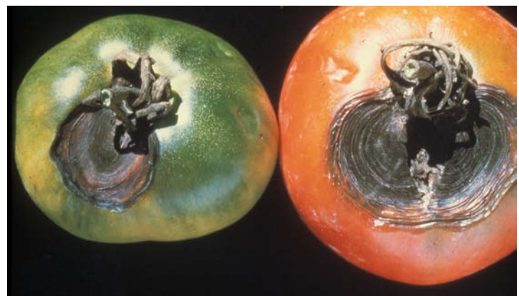
Figure 4: Fruit symptoms caused by early blight.