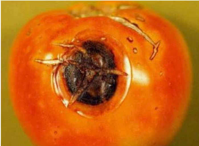
Figure 10: Fruit lesion caused by Phoma rot.

Stem and fruit symptoms are very similar to early blight. Lesions on stems are dark and elongate with concentric rings. Stem lesions may completely girdle the stems resulting in death. On fruit, lesions may occur in any location as the fungus invades openings created through cracks, stem scars, mechanical injuries or insect feeding sites. Dark, lesions with concentric rings may develop over portions of the fruit (Fig.10). The lesions become leathery with time and are distinguished by the development of pycnidia in the diseased tissue.