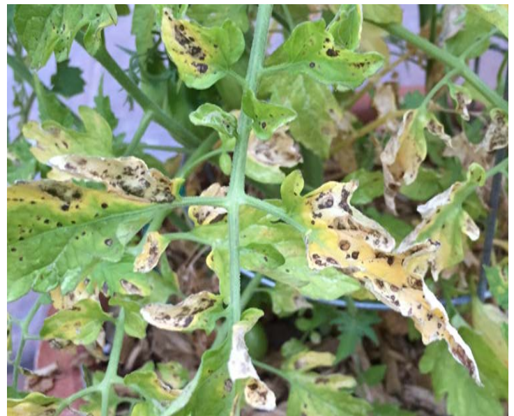
Figure 8: Blight developing on leaves infected by Phoma rot.