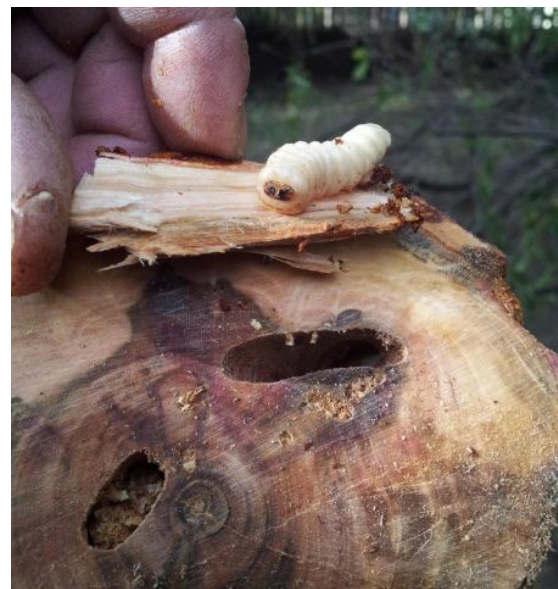
Figure 11. Larva and galleries of the red-necked longhorn beetle