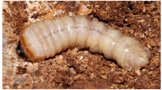
Figure 7. Red-necked longhorn beetle larva