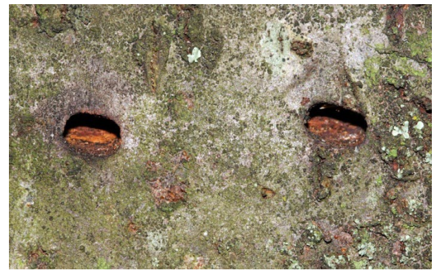
Figure 9. Red-necked longhorn beetle emergence holes