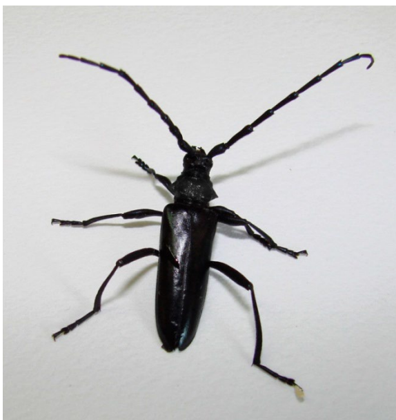
Figure 4. Red-necked longhorn beetle adult with a black pronotum