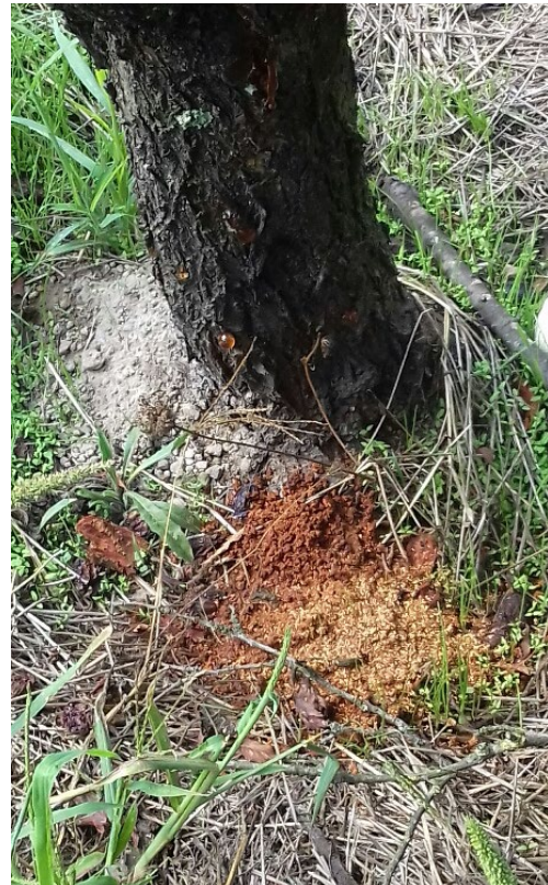
Figure 3. Larval frass of the red-necked longhorn beetle at the base of a Prunus tree in Italy