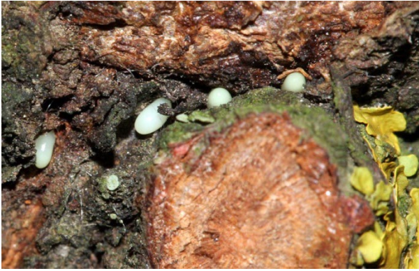
Figure 6. Red-necked longhorn beetle eggs