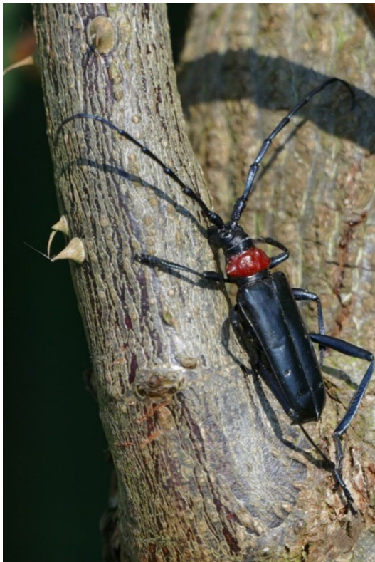
Figure 2. Red-necked longhorn beetle adult with the characteristic red pronotum

uniform metallic green, blue violet, copper or black. In addition, the larvae of A. moschata mainly develop in Salix spp.(willows) and have never been recorded in Prunus spp..