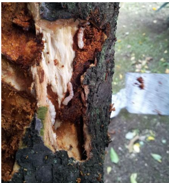
Figure 10. Prunus infested with red-necked longhorn beetle larvae