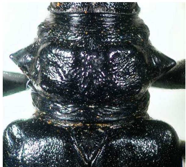
Figure 5. Close-up of a black pronotum