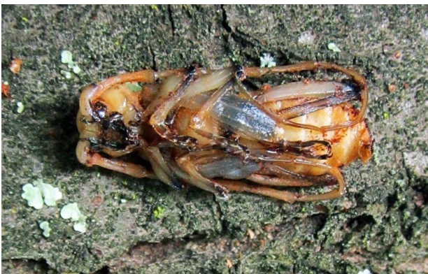
Figure 8. Red-necked longhorn beetle pupa