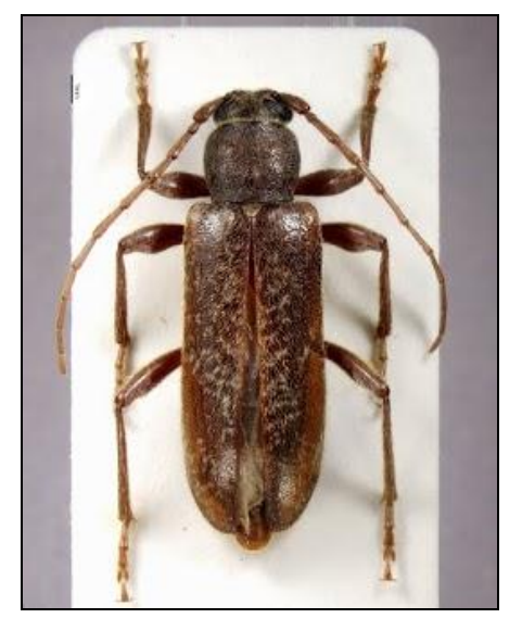
Figure 4. Trichoferus campestris (female).