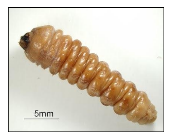
Figure 2. Trichoferus campestris larva.