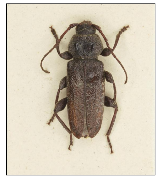
Figure 5. Asemum striatum. A native British longhorn beetle.