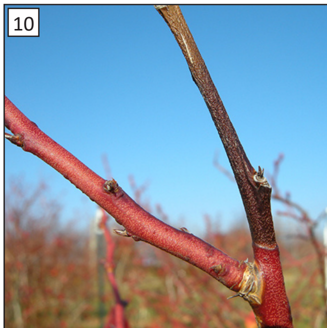
FIGURE 10. THE SHOOT BLIGHT PHASE ORIGINATES IN BUDS AND SPREADS INTO TWIGS AND BRANCHES.