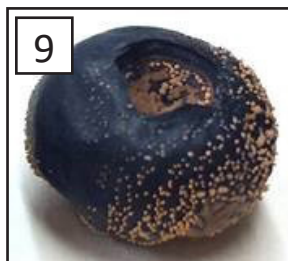
FIGURE 9. ANTHRACNOSE RIPE ROT IS RECOGNIZED BY MASSES OF SALMON-COLORED STICKY SPORES.

Anthracnose is a fungal disease caused by the fungus Colletotrichum fioriniae ( C. acutatum species complex), but it can also be caused by other Colletotrichum species. These fungi overwinter in diseased branches, old fruit spurs, and bud scales, as well as on infected fruit left on the plant or on the ground. Spores (conidia) are released during rainy periods throughout the growing season and are spread via rain splash and overhead irrigation. The sticky spores can also be spread by workers and equipment. Infections may occur anytime, beginning during bloom. Temperatures between 60°F and 80°F, along with leaf wetness exceeding 12 hours, favors infection.