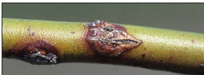
FIGURE 7. BOTRYOSPHAERIA STEM CANKERS APPEAR RED WITH A ROUGH BLISTERED APPEARANCE.

Botryosphaeria stem canker first appears as small red lesions on succulent twigs, which often resemble winter injury. These lesions develop into girdling cankers that result in dieback above the cankers; centers of cankers become filled with tiny black fungal fruiting structures. Second-year cankers may have a rough or blistered appearance (FIGURE 7).