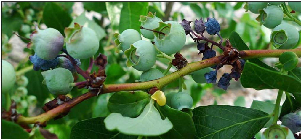
FIGURE 1. PHOMOPSIS CANKER LESIONS ARE INITIALLY REDDISH-BROWN AND DEVELOP AROUND BUD SITES ON 1-YEAR-OLD SHOOTS.

wounds on young woody stems or newly emerging branches, causing cankers. During the second year, twigs become blighted and bud loss is more severe. Infection through stems is most common on those damaged or wounded by freeze.