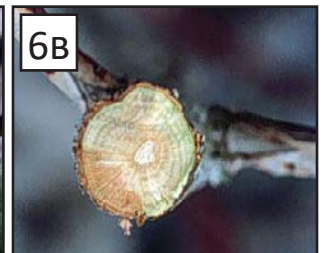
FIGURE 5 BOTRYOSPHAERIA DIEBACK / STEM BLIGHT CAUSES YOUNG SUCCULENT BRANCHES TO DIE. FIGURE 6. INTERNAL WOOD OF DISEASED BRANCHES BECOMES DISCOLORED ON THE SIDE OF THE INFECTION (A); THE DISCOLOURATION IS SHOWN IN CROSS-SECTION HERE (B).