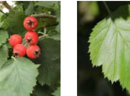
Figures 1 and 2: Example of fruit and leaf of Kansas hawthorn. Alternate Names: red hawthorn and Eggert thorn

Contributed by: USDA NRCS Plant Materials Center Manhattan, Kansas