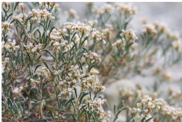
Figure1: Clay-loving wild buckwheat, Eriogonum pelinophilum.. Photo USFWS, Alicia Langton July 2010.

Contributed by: USDA NRCS Colorado Plant Materials Program