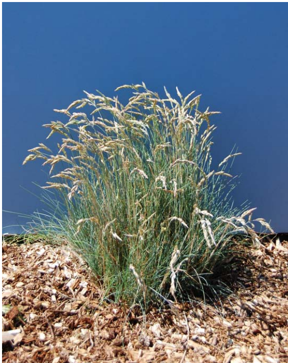
Figure 1. Sand fescue in flower. Photo by Dale Darris.

Contributed by: USDA NRCS Plant Materials Center, Corvallis, Oregon