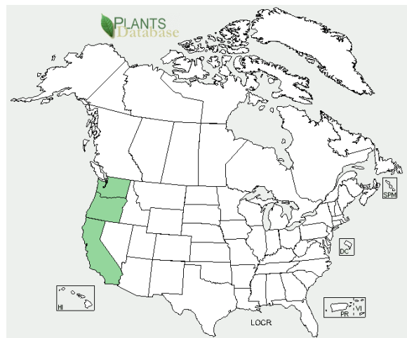
Big deervetch distribution from USDA-NRCS PLANTS Database.

Big deervetch is common in openings in chaparral, pine or mixed woodlands, as well as on stream banks, disturbed areas and roadsides. It is a fast grower that does best in full sun on fine- to medium-textured, well-drained soils. It grows in areas with 14–80 inches mean annual precipitation, but is drought-tolerant and tolerates temperatures down to -3^{\circ}F . Plants are fire-stimulated, germinating readily from the seed bank, even after intense fires. Its native range includes southwestern Washington, western Oregon, California and Baja California, Mexico at elevations up to 8000 feet. Variety otayensis is found only on Otay Mountain, San Diego County, CA and into Baja California. For updated distribution, please consult the Plant Profile page for this species on the PLANTS Web site.