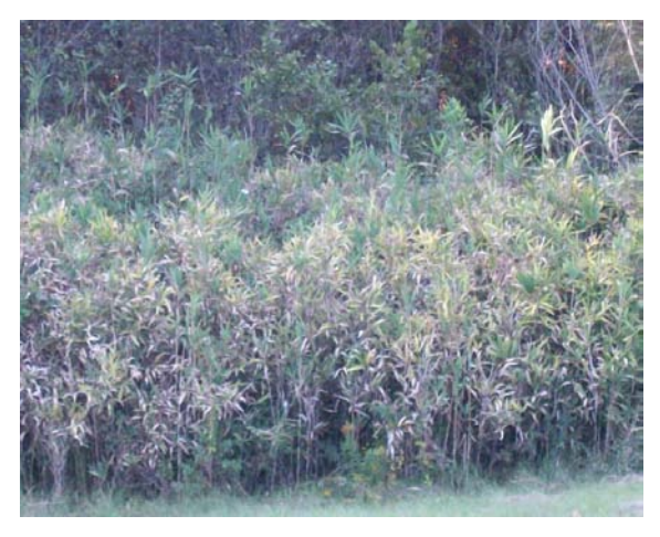
Figure 2. Stand of giant cane (Arundinaria gigantea). Photo taken on tribal lands of the Mississippi Band of Choctaw Indians, taken by Timothy Oakes, 2011.

hunting squirrels, rabbits, and various birds (Bushnell 1909; Hamel and Chiltoskey 1975; Speck 1941; Kniffen et al. 1987). Young Cherokee boys used giant cane blowguns armed with darts to protect ripening cornfields from scavenging birds and small mammals (Fogelson 2004). The Choctaw used the butt end of a cane, where the outside skin was thick, as a knife to cut meat, or as a weapon (Swanton 1931). Tribes of Louisiana made flutes, duck calls, and whistles out of cane (Kniffen et al. 1987). Cane is best harvested in the fall or winter (October to February) for blow guns and flutes, and plant stems, known as culms, are selected from mature, hardened off plants with larger diameters.