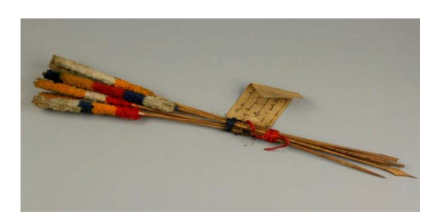
Figure 4. Chitimacha blowgun darts of fire-treated split cane. Courtesy of the Department of Anthropology, Smithsonian Institution F76807.

Young shoots were cooked as a potherb and ripe seeds were gathered in the summer or fall and ground into flour for food (Morton 1963; Hitchcock and Chase 1951). Flint (1828) says of a subspecies of giant cane, Arundinaria gigantea ssp. macrosperma : "It produces an abundant crop of seed with heads like those of broom corn. The seeds are farinaceous and are said to be not much inferior to wheat, for which the Indians and occasionally the first settlers substituted it." Giant cane also has medicinal properties. Both the Houma and the Seminole made a decoction of the roots: the Houma used it to stimulate the kidneys and renew strength, and the Seminole used it as a cathartic (Speck 1941; Sturtevant 1955 cited in Moerman 1998).