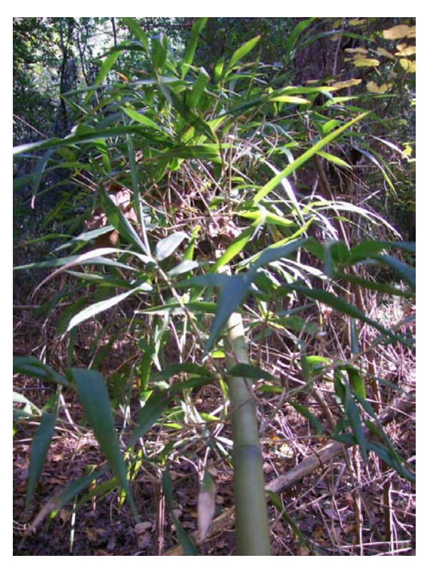
Figure 1. Giant cane (Arundinaria gigantea). Photo taken on tribal lands of the Mississippi Band of Choctaw Indians, taken by Tim Oakes, 2011.

Contributed by: USDA NRCS National Plants Data Team, Greensboro, NC