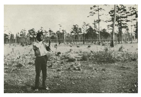
Figure 3. A Choctaw man demonstrating how a blowgun is positioned for shooting. The blowgun is about 7 feet in length and made of a single piece of giant cane. Photo by David I. Bushnell, Jr., 1909. Courtesy of the Smithsonian National Museum of Natural History, National Anthropological Archives.