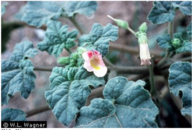
W.L. Wagner Smithsonian Institution, Botany Department

Found in disturbed dry places below 1000 m. in the deserts of southwestern California to Arizona, southern Nevada, to western Texas and northern Mexico. For current distribution, please consult the Plant Profile page for this species on the PLANTS Web site.