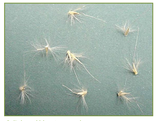
Split beard bluestem seeds.

Plant Hardiness Zones 8a and 8b of the Western Coastal Plain. Neches Germplasm is recommended for use in seed mixtures for establishment of conservation cover and wildlife habitat plantings in native pine ( Pinus sp.) stands.