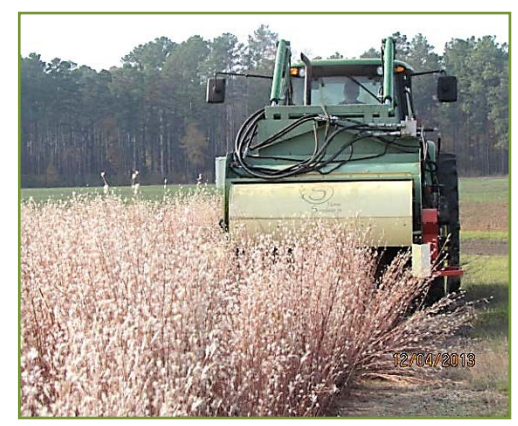
Harvesting fluffy seed of split beard bluestem with a flail harvester.

Split beard bluestem ecotypes are commercially available. Purchase split beard bluestem seed based on local climate, resistance to local pests, and intended use. Consult with your local land grant university, local extension or local USDA NRCS office for recommendations on adapted materials for use in your area. Neches Germplasm split beard bluestem is a composite release adapted to Major Land Resource Areas 133B and 87A in USDA