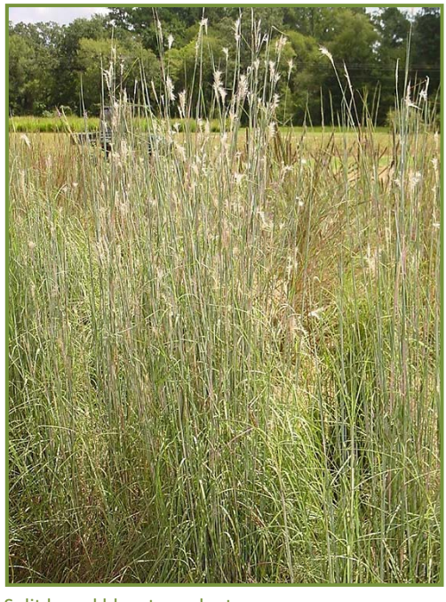
Split beard bluestem plant.

Habitat : Split beard bluestem is found on upland woodlands and woodland pastures and is commonly associated with little bluestem ( Schizachyrium scoparium ) on well drained sandy sites (Diggs et al., 2006 and Grelen and Hughes, 1984).