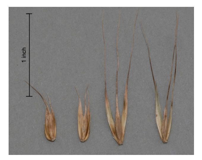
Figure 2: Comparison of Virginia and southeastern wildrye spikelets.

Mature, upright, spikes are fully emerged above the foliage, 1 to 2 inches wide, and up to 8 inches long. Southeastern wildrye flowers from May through July and is largely self- pollinated and occasionally pollinated by wind. Flowering usually occurs two to four weeks after Virginia wildrye (Barkworth 2007). The evenly distributed, dull green leaves are about one-third to two-thirds of an inch wide. Southeastern wildrye increases in width by tillers, it does not spread from rhizomes, and the root system is fibrous. Fibrous roots attach firmly to soil particles, making them especially effective in preventing soil erosion.