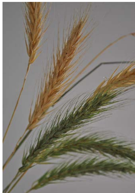
Figure 3: Fusarium Head Blight symptoms on seed.

Diseases: Plants established after a glyphosate treatment may develop fusarium head blight (Figure 3), a condition which affects seed quality but not foliage (Fernandez 2005).