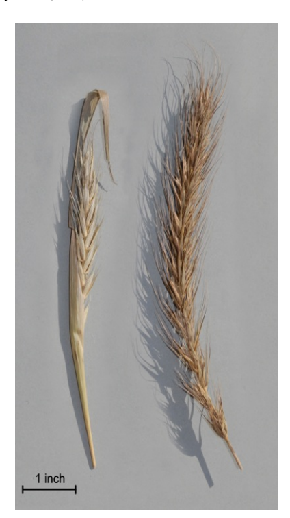
Figure 1: Comparison of Virginia and southeastern wildrye spikes.

General: Originally described as a variety of Canada wildrye, southeastern wildrye at times has been classified as a variety of Virginia wildrye (e.g. Hitchcock 1951), but more recently is recognized as a distinct species (Barkworth et al. 2007). Southeastern wildrye is a 4 foot tall, cool season, clump-forming, perennial grass. As with its domestic relatives, wheat and rye, seeds are borne in terminal spikes (ears).