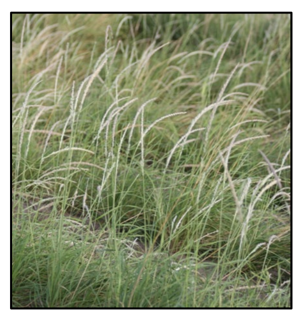
Forrest Smith, South Texas Natives

Distribution : Please consult the Plant Profile page for this species on the PLANTS website for current distribution. It is found in Texas, New Mexico, and Arizona.