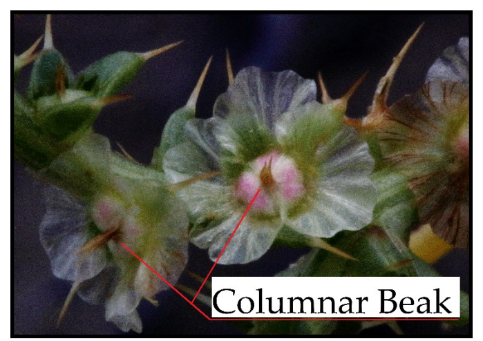
Figure 4: Barbwire Russian thistle flower with the long and stiff columnar beak labeled. The beak is a prominent characteristic of this species and is formed by the upper half of the perianth protruding over the fruit.

nicknamed Salsola paulsenii lax because of a lax tip on the perianth, has genetic markers of S. tragus, S. paulsenii, S. australis, and unique genetic markers that may represent a lack of genetic sampling or a fourth unknown species. It is of interest because it is hexaploid (2n=54) and might be a new species (Arnold 1972, McGray et al 2008, Ayres et al. 2009).