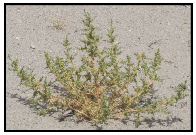
Figure 1: Barbwire Russian thistle (Salsola paulsenii).

Most Pre-1970s literature listed barbwire Russian thistle as S. pestifer A. Nelson, now recognized as a synonym of S. tragus L.. In 1967, barbwire Russian thistle was recognized as a distinct species (Beatley 1973, Mosyakin 1996).