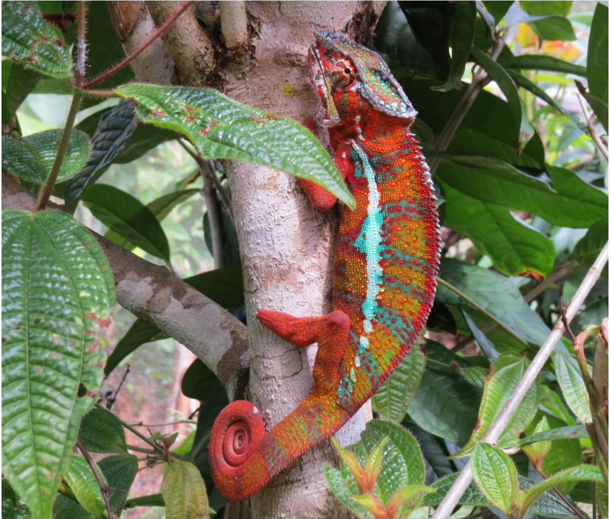
Colour variants of Furcifer pardalis .