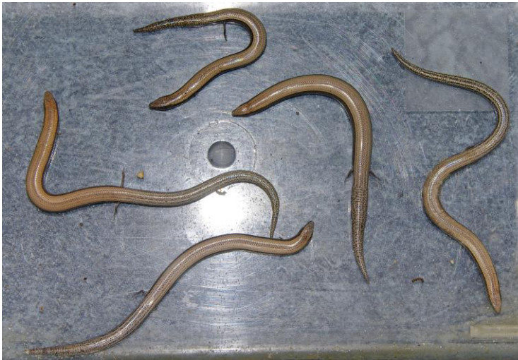
Adult group May 2014.