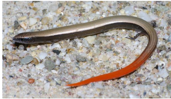
Newly born juvenile of Chalcides mauritanicus .

Chalcides mauritanicus is an elongated and small-sized skink with strongly reduced limbs. CAPUTO et al. (1995) gave measurements for ten adult specimen with mean snout-vent length ranging from 54.7-71.8 mm. MARTÍN et al (2015) measured snout-vent lengths of 64-74 mm for males and 70-83 mm for females. Tail lengths range from 54 mm for males to 64-74 mm for females. My heaviest animal (probably the female) weighed 3.6 g but lost its tail during the weighing. I weighed the tail separately and it weighed 1.2 g so the tail made up 33% of the total body weight. My animals are heavier than cited by MARTÍN et al. (2015) or CAPUTO et al. (1995). However, the lengths of my animals fall within the range of these publications. My largest animal measured 155 mm in total length (Table 1).