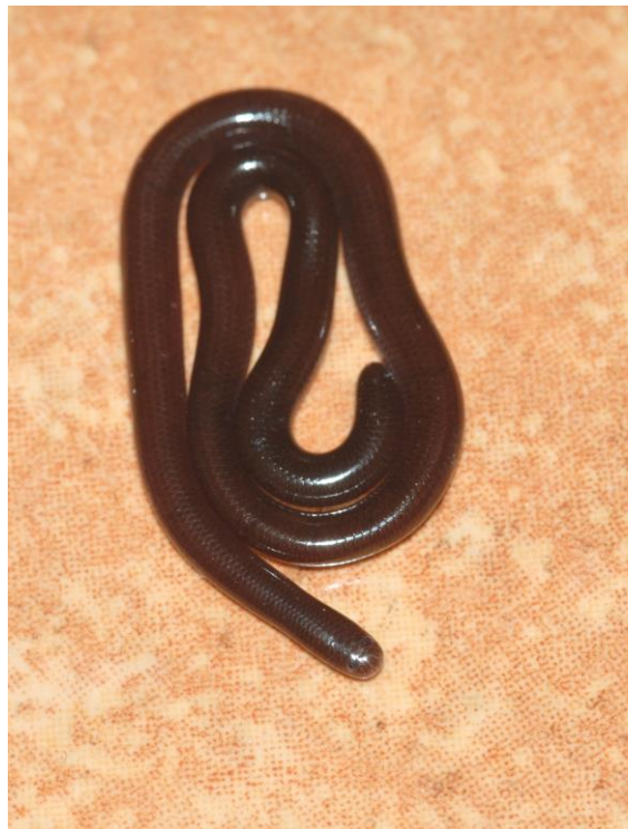
Indotyphlops braminus from Tenerife, Santa Cruz de Tenerife, Canary Isles, Spain, Botanical Garden El Palmetum, alt. 35m., March 21, 2019.

The most similar species morphologically and genetically to Indotyphlops braminus are found in the South Asian Indotyphlops pammeces species group and the Australopapuan Anilius polygrammicus species group (Table 1). The pammeces group shares minute body size, 20 scale rows without reduction, the supranasal suture joining the narrow rostral dorsally, and in half the species the infranasal suture contacting the preocular. All species in the group except I. pammeces are from Sri Lanka but the most