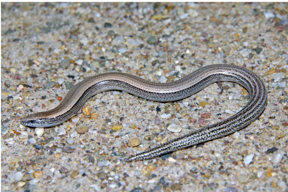
Greyish adult specimen of Chalcides mauritanicus .

Chalcides mauritanicus was initially described as Heteromeles mauritanicus . Heteromeles was established as a new genus for this species by DUMÉRIL & BIBRON (1839) because of the absence of several fingers and toes. However, they already wrote that its morphology resembles that of 'Seps chalcide' (now Chalcides chalcides ). The first specimen was delivered to them by lieutenant-colonel Levailant and came from Algeria. No exact locality is given but according to PASTEUR & BONS (1960) it should be Oran as