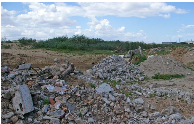
Already in 2009 destruction of the C. mauritanicus habitat had started at Saïdia (locality 1).

Chalcides mauritanicus is a viviparous species that has small litters of two or three young. The species is extremely fossorial and does not become 'tame' in captivity and are therefore not recommended as pet, since hand-feeding is sometimes necessary to help animals in a poorer condition. Even studying their behaviour is hard in captivity. It seems