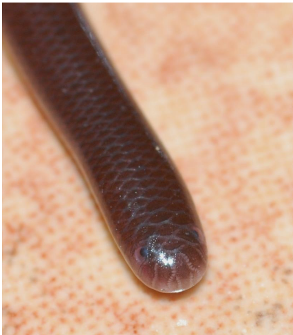
Indotyphlops braminus from Tenerife, Santa Cruz de Tenerife, Canary Isles, Spain, Botanical Garden El Palmetum, alt. 35m., March 21, 2019.

Thirdly, the head of I. braminus exhibits prominent and distinct subcutaneous sebaceous glands arranged in rows beneath each head shield (also present in the I. pammeces species group). These gland lines run parallel to and along the margins of the anterior head shields. A unique situation involves the gland lines of the prenasal or anterior nasal (N1) shield and the median rostral (R) shield. As the gland line on the lower or anterior rostral (ARL) ascends towards the top of the snout it is interrupted by the supranasal gland line (SNL) on the prenasal (N1) shield, which is confluent with the