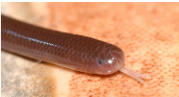
Indotyphlops braminus from Tenerife, Santa Cruz de Tenerife, Canary Isles, Spain, Botanical Garden El Palmetum, alt. 35m., March 21, 2019.

Our knowledge of the geographic distribution of I. braminus was limited to fewer than 40 countries in the 19 th Century (1803–1900) but the 20 th Century (1900–1999) saw that number double to 81 and in just the past 20 years (2000–2020) it has been found in another 40 countries for a current total of 118 countries or island entities (WALLACH, 2020). It occurs on more than 540 islands worldwide and ranges in elevation from sea level to more than 3000 m.