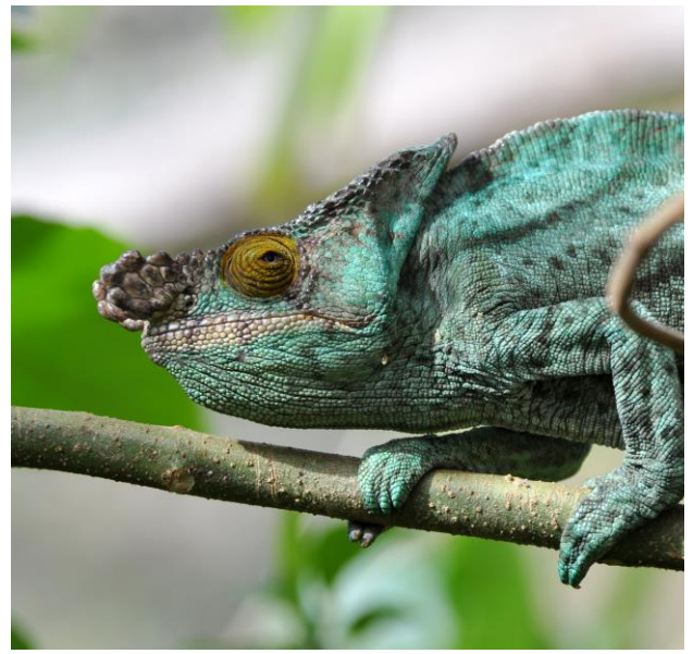
Calumma parsoni , female left, male right.