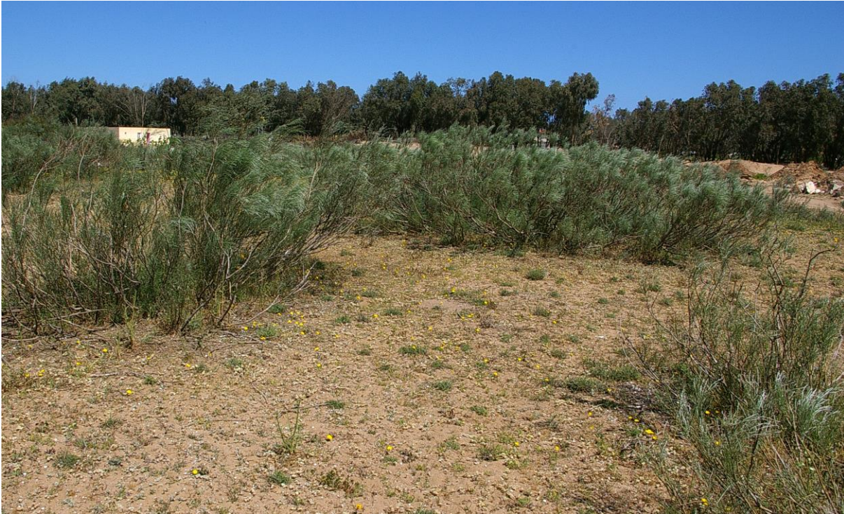
Locality 1: habitat west of Saïdia.

The third locality was about 500 m inland from the seashore, also in an isolated former dune area. It was searched on April 16, 2009 (N35°05'37" W2°15'11"). It was difficult to find Chalcides mauritanicus because there was much less trash to turn over; only two specimens were seen. Other species observed were Agama impalearis , Psammodromus algerius , Chalcides parallelus , Tarentola mauritanica , Acanthodactylus boskianus , Testudo graeca and Macroprotodon sp.