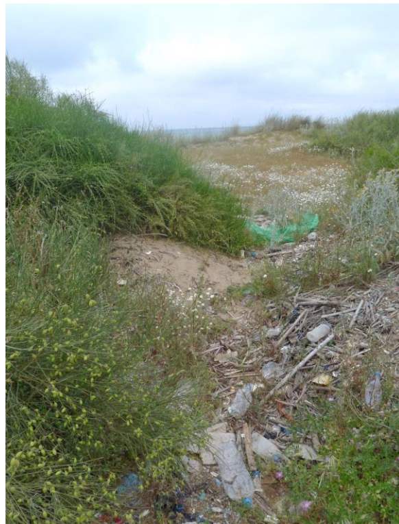
Locality 2: habitat in dunes west of Saïdia.

Because very little is known about the breeding ecology or behaviour of C. mauritanicus , I considered it opportune and scientifically re-