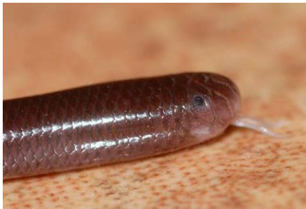
Frontispiece: Indotyphlops braminus .

Click on a title to go directly to an individual article