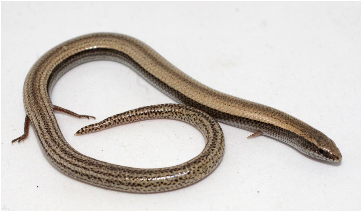
Adult Chalcides mauritanicus .