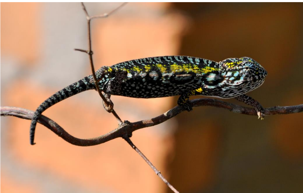
Furcifer lateralis .