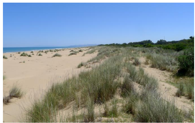
Locality 4: pristine habitat, dunes of Ras el Ma.