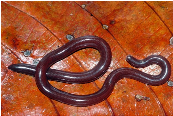
Indotyphlops braminus , from Hooliongapar Gibbon Sanctuary, Assam State, NE India, 130 m., 15 March 2009.

stones. This snake may be mistaken for an earthworm upon superficial inspection. However, a closer examination will easily determine that it is a snake as it is covered with shiny, hard scales, lacks segmentation, has a forked tongue, a pair of dark eyespots, wiggles rapidly like a snake on smooth surfaces (like the bathroom floor where it is frequently found), and disappears into loose soil very quickly.