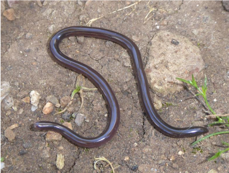
Indotyphlops braminus from Tenerife, Santa Cruz de Tenerife, Canary Isles, Spain, Botanical Garden El Palmetum, alt. 35m., March 21, 2019.