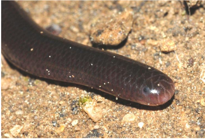
Indotyphlops braminus from Tenerife, Santa Cruz de Tenerife, Canary Isles, Spain, Botanical Garden El Palmetum, alt. 35m., March 21, 2019.