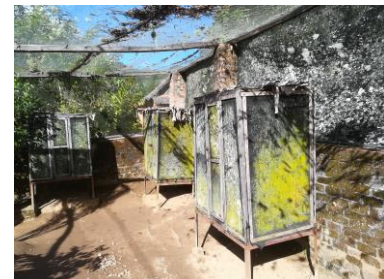
Enclosures of various shapes and sizes.

After the simple entrance and reception building an open area is situated, consisting of a small lake in a grass environment, fenced with brick walls. A couple of Nile Crocodiles ( Crocodylus niloticus ) are housed there. The largest cage (ca. 60x20x3 m) is located in a more overgrown area. On top of low brick walls rough-mesh screens, attached to wooden poles are fastened. The housing is exposed to natural conditions of sunshine, rain and wind. Dense vegetation provide plenty of shade and shelter. In that cage some 60 chameleons are housed comprising about eight species of larger chameleons like Furcifer oustaleti , F. pardalis and Calumma parsonii . On first impression the housing