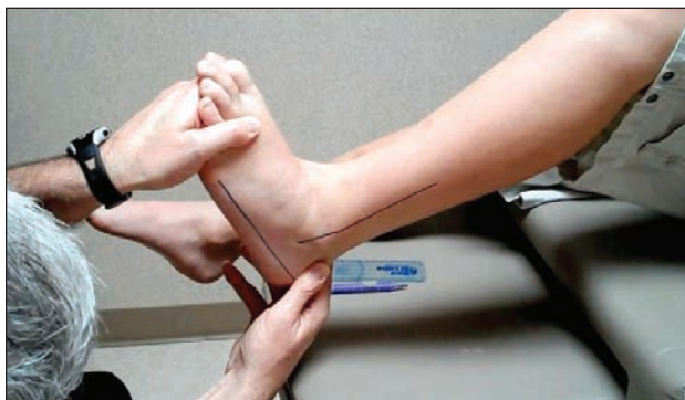
Figure 3: Evaluation of the ankle joint dorsiflexion with the knee bent removes the pull of the gastrocnemius muscle and allows the practitioner to determine whether equinus is gastrocnemius equinus or gastrosoleal equinus.

ambulation, therefore the term pseudoequinus. The combined equinus is just a combination of one type of muscular and osseous equinus.