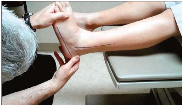
Figure 2: The Silverskiold test is used to evaluate for equinus. This demonstrates evaluation of the dorsiflexion of the ankle joint with the knee extended.

There are two primary types of equinus—muscular and osseous, with subgroups of each kind. In the muscular group there can be either spastic or non-spastic equinus. Either of these subgroups of spastic or non-spastic equinus can further be broken down into gastrocnemius or gastrosoleus equinus. The osseous forms of equinus include: anterior tibiotalar exostosis (best seen on a lateral charger view on X-ray), distal tibial-fibular osseous bridging from prior trauma, pseudoequinus and combined equinus. Pseudoequinus occurs in the cavus foot structure where ankle joint dorsiflexion occurs to dorsiflex the forefoot, which is plantarflexed to the rearfoot. The ankle dorsiflexion used to do this then limits the amount available for normal