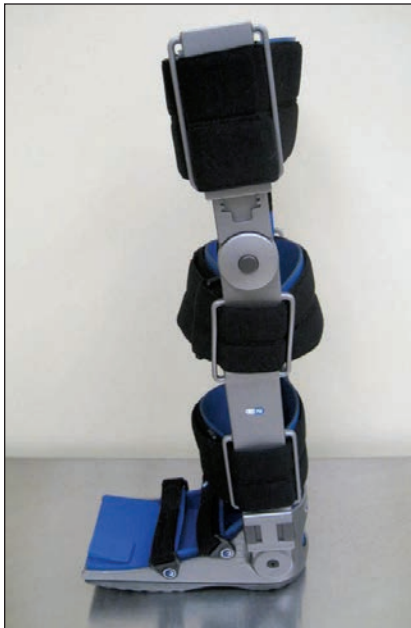
Figure 6: In this side view of the EQ/IQ brace, you can see the hinge to be placed at the knee joint. When the brace crosses the knee joint, it allows for stretching of the entire GSC. The hinge allows for the brace to engage just the soleus if taken down or the entire GSC if left intact.

or have a relationship to equinus will be discussed with some of the well-documented literature.