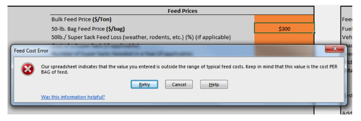
Figure 2: Example of an Error Message in the FSAS Template.

It should also be noted other types of equipment and accessories could be included in a feeding system. For example, an overhead bin could be used as a way for producers to have large quantities of bulk feed delivered to their respective operapickup-loaded feed containers. Descriptions and diagrams of tions. While overhead bins provide a technique for storing bulk