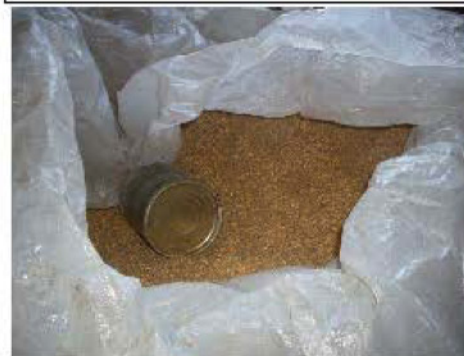
http://hubpages.com/a nima b/The Life-of-a-Chick-From-Newly-Haltched-to-Adult

3. Feed is manually scooped out of a super sack, typically using a bucket