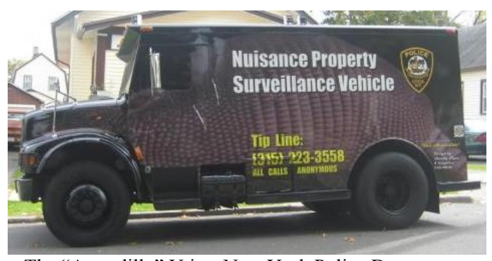
The "Armadillo" Utica, New York Police Department