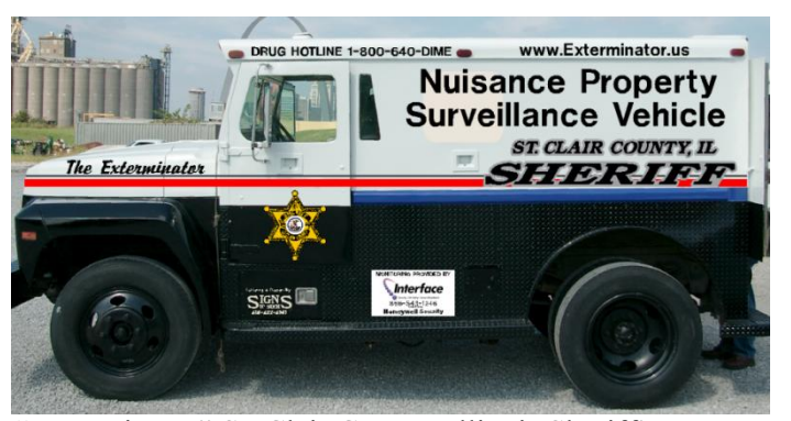
The "Exterminator" St. Clair County, Illinois Sheriff's Department