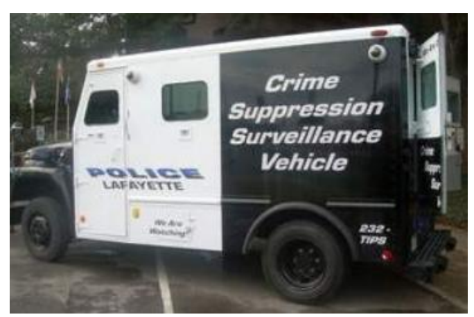
Lafayette, Louisiana Police Department's "Armadillo"