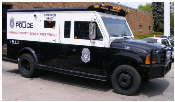
Milwaukee, Wisconsin Police Department's Nuisance Surveillance Vehicle