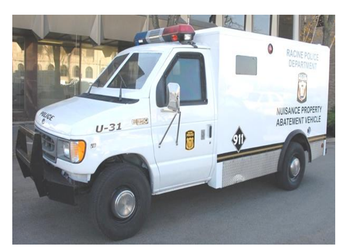
The "NPAV" Racine, Wisconsin Police Department