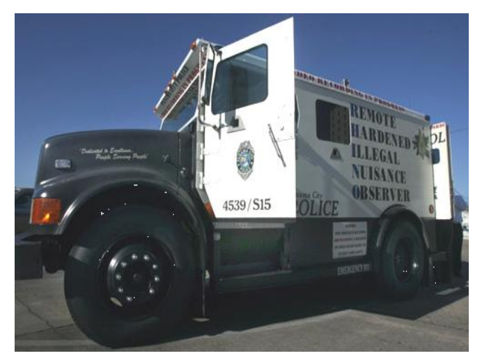
The Panama City, Florida Police Department's "RHINO"