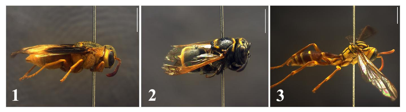
Fig 1: New Records of social wasp (Hymenoptera: Vespidae) in Minas Gerais State: 1. Parachartergus smithii (de Saussure, 1854), 2. Brachygastra moebiana (de Saussure, 1867), 3. Mischocyttarus montei Zikan 1949. Scale bar 2mm.

(http://vespas.ifs.ifsuldeminas.edu.br).