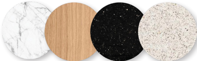
Marble Wood Granite Caesar stone*