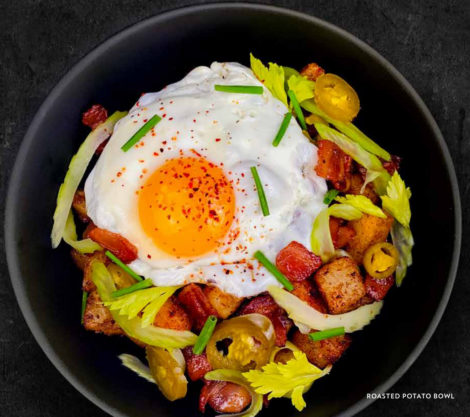
ROASTED POTATO BOWL

* MenuTrends YE JUN'22, PENETRATION: Of restaurants serving apps, entrées, or sides, % that offer all forms of potatoes (excluding sweet potatoes).